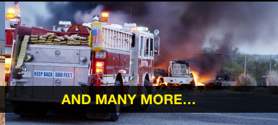
AND MANY MORE...