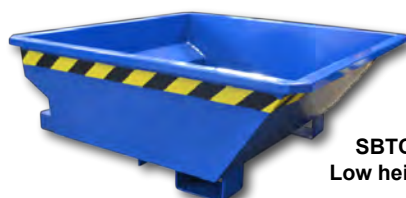
SBTCMIN Low height model