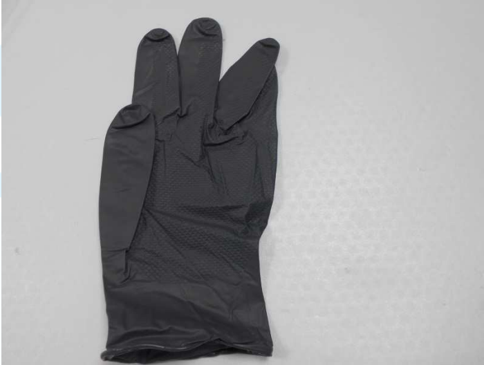
Gloves described as GRIPPAZ 246 (article number 1.44.550.00, 1.44.560.00, 1.44.570.00 M-Safe 246 Nitrile Grippaz gloves)