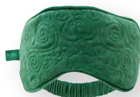
51.530.011 Sleeping Mask One size Velvet Quiltey Days Green 100% Polyester Velvet 1/200