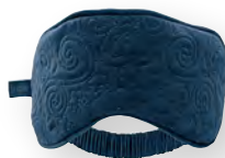
51.530.010 Sleeping Mask One size Velvet Quiltey Days Blue 100% Polyester Velvet 1/200