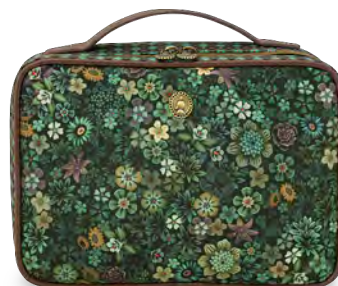
51.274.226 Beauty Case Square Large 27x10x19 cm Tutti i Fiori Green 60% PVC - 40% Polyester Compartments: 2 - Pockets: 2 - Ltr: 4 1/12