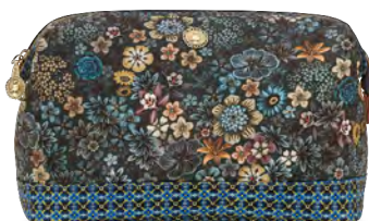
NEW | 51.274.234 Cooper Cosmetic Purse Large 26x12x18 cm Tutti i Fiori Blue 60% Polyester - 40% PVC Compartment: 1 - Pockets: 3 - Ltr: 4 1/24