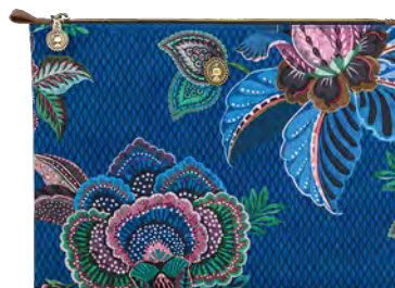
NEW | 51.274.236 Charly Cosmetic Flat Pouch Large 30x1x22 cm Cece Fiore Blue 60% Polyester - 40% PVC Compartment: 1 - Pocket: 1 - Ltr: 0.4 1/60