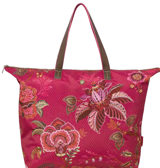
NEW | 51.273.383 Tilda Tote Bag 66x20x44 cm Cece Fiore Red 60% Polyester - 30% PVC - 10% PU Compartment: 1 - Pockets: 3 - Ltr: 17 1/24