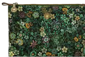
NEW | 51.274.249 Charly Cosmetic Flat Pouch Medium 24x1x15.5 cm Tutti i Fiori Green 60% Polyester - 40% PVC Compartment: 1 - Pocket: 1 - Ltr: 0.3 1/48