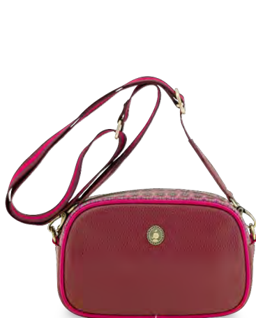
NEW | 51.273.379 Frida Cross Body Bag Small 21x6x13 cm Red 40% PU - 30% PVC - 30% Polyester Compartment: 1 - Pockets: 2 - Ltr: 1.2 Detachable strap 1/24