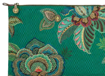
NEW | 51.274.252 Charly Cosmetic Flat Pouch Large 30x1x22 cm Cece Fiore Green 60% Polyester - 40% PVC Compartment: 1 - Pocket: 1 - Ltr: 0.4 1/60