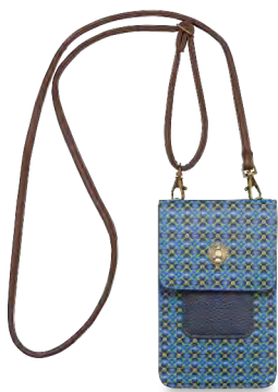
51.273.348 Phone Bag 11x1x18 cm Clover Blue 90% PVC - 10% PU Compartment: 1 - Pocket: 1 - Ltr: 0.1 Detachable strap 1/48