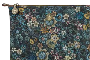
NEW | 51.274.233 Charly Cosmetic Flat Pouch Medium 24x1x15.5 cm Tutti i Fiori Blue 60% Polyester - 40% PVC Compartment: 1 - Pocket: 1 - Ltr: 0.3 1/48