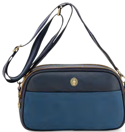
NEW | 51.273.371 Frida Cross Body Bag Medium 26.5x7.5x16.5 cm Blue 40% PU - 30% PVC - 30% Polyester Compartment: 2 - Pockets: 2 - Ltr: 2.5 Detachable strap 1/16