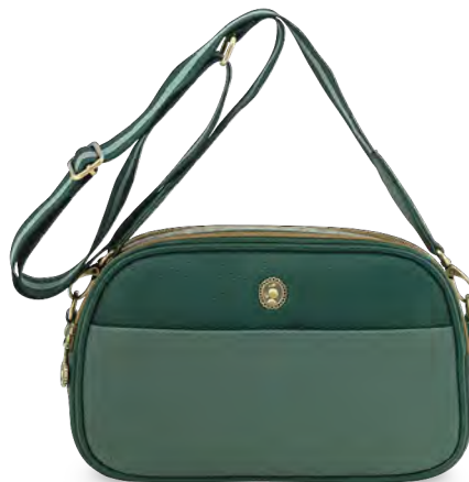
NEW | 51.273.389 Frida Cross Body Bag Medium 26.5x7.5x16.5 cm Green 40% PU - 30% PVC - 30% Polyester Compartment: 2 - Pockets: 2 - Ltr: 2.5 Detachable strap 1/16