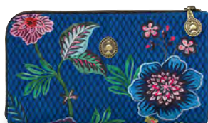
NEW | 51.274.235 Cloe Cosmetic Zipper Pouch 21x3.5x12.5 cm Cece Fiore Blue 60% Polyester - 40% PVC Compartment: 1 - Ltr: 0.1 1/64