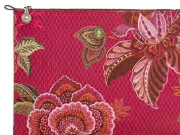
NEW | 51.274.244 Charly Cosmetic Flat Pouch Large 30x1x22 cm Cece Fiore Red 60% Polyester - 40% PVC Compartment: 1 - Pocket: 1 - Ltr: 0.4 1/60