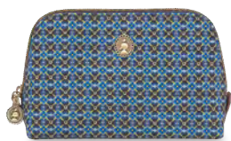
NEW | 51.274.231 Coby Cosmetic Bag Triangle Small 19/15x6x12 cm Clover Blue 60% Polyester - 40% PVC Compartment: 1 - Pockets: 2 - Ltr: 0.5 1/36