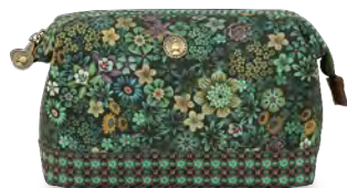
51.274.224 Cosmetic Purse Medium 22.5x9.5x15 cm Tutti i Fiori Green 60% Polyester - 40% PVC Compartment: 1 - Pockets: 2 - Ltr: 2.3 1/36