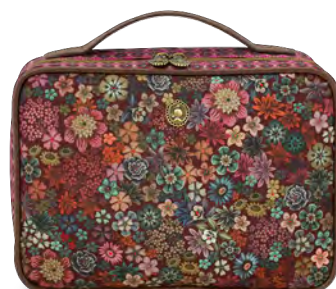
51.274.223 Beauty Case Square Large 27x10x19 cm Tutti i Fiori Pink 60% PVC - 40% Polyester Compartments: 2 - Pockets: 2 - Ltr: 4 1/12