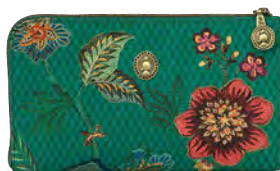
NEW | 51.274.251 Cloe Cosmetic Zipper Pouch 21x3.5x12.5 cm Cece Fiore Green 60% Polyester - 40% PVC Compartment: 1 - Ltr: 0.1 1/64