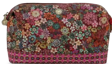
NEW | 51.274.242 Cooper Cosmetic Purse Large 26x12x18 cm Tutti i Fiori Pink 60% Polyester - 40% PVC Compartment: 1 - Pockets: 3 - Ltr: 4 1/24