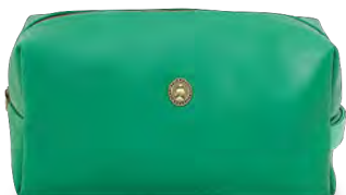
NEW | 51.274.245 Coco Cosmetic Bag Medium 21.5x10x10.5 cm Green 40% PU - 30% PVC - 30% Polyester Compartment: 1 - Pockets: 2 - Ltr: 1.5 1/24