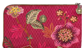
NEW | 51.274.243 Cloe Cosmetic Zipper Pouch 21x3.5x12.5 cm Cece Fiore Red 60% Polyester - 40% PVC Compartment: 1 - Ltr: 0.1 1/64