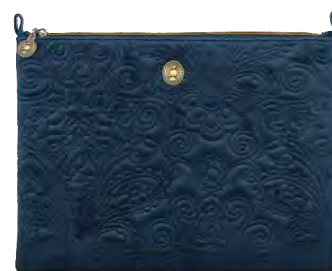
51.274.208 Cosmetic Flat Pouch Large 30x1x22 cm Velvet Quiltey Days Blue 60% Polyester Velvet - 40% PVC Compartment: 1 - Pocket: 1 - Ltr: 0.4 1/60