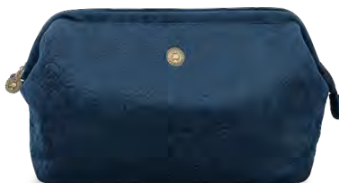
51.274.217 Cosmetic Purse Extra Large 30x13.8x20.7 cm Velvet Quiltey Days Blue 60% Polyester Velvet - 40% PVC Compartment: 1 - Pockets: 3 - Ltr: 6 1/16