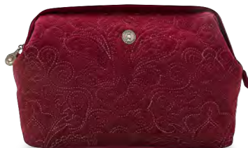
51.274.190 Cosmetic Purse Extra Large 30x13.8x20.7 cm Velvet Quiltey Days Red 60% Polyester Velvet - 40% PVC Compartment: 1 - Pockets: 3 - Ltr: 6 1/16