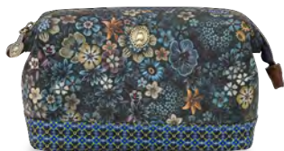
51.274.218 Cosmetic Purse Medium 22.5x9.5x15 cm Tutti i Fiori Blue 60% Polyester - 40% PVC Compartment: 1 - Pockets: 2 - Ltr: 2.3 1/36