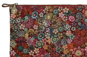
NEW | 51.274.241 Charly Cosmetic Flat Pouch Medium 24x1x15.5 cm Tutti i Fiori Pink 60% Polyester - 40% PVC Compartment: 1 - Pocket: 1 - Ltr: 0.3 1/48