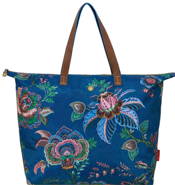
NEW | 51.273.374 Tilda Tote Bag 66x20x44 cm Cece Fiore Blue 60% Polyester - 30% PVC - 10% PU Compartment: 1 - Pockets: 3 - Ltr: 17 1/24