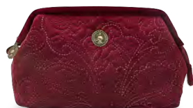
51.274.188 Cosmetic Purse Small 19x8.5x12 cm Velvet Quiltey Days Red 60% Polyester Velvet - 40% PVC Compartment: 1 - Pockets: 2 - Ltr: 1 1/36