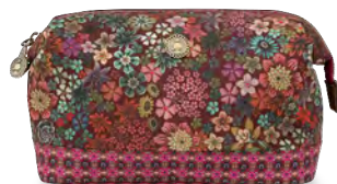
51.274.221 Cosmetic Purse Medium 22.5x9.5x15 cm Tutti i Fiori Pink 60% Polyester - 40% PVC Compartment: 1 - Pockets: 2 - Ltr: 2.3 1/36