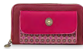
NEW | 51.273.377 Wally Wallet Pocket 19.5x4.5x11 cm Red 40% PU - 30% PVC - 30% Polyester Compartments: 2 - Pockets: 3 Fits 16 cards 1/60