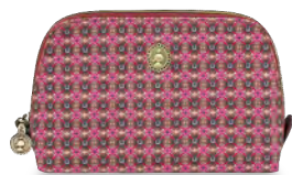
NEW | 51.274.239 Coby Cosmetic Bag Triangle Small 19/15x6x12 cm Clover Pink 60% Polyester - 40% PVC Compartment: 1 - Pockets: 2 - Ltr: 0.5 1/36