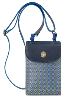
NEW | 51.273.369 Pippa Phone Bag 13.5x3x20 cm Clover Blue 40% PU - 30% PVC - 30% Polyester Compartment: 3 - Pocket: 1 - Ltr: 0.1 Fits 3 cards 1/48