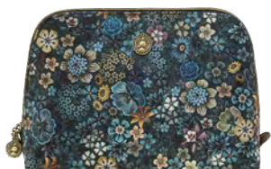
NEW | 51.274.232 Coby Cosmetic Bag Triangle Medium 24/17x8x16.5 cm Tutti i Fiori Blue 60% Polyester - 40% PVC Compartment: 1 - Pockets: 3 - Ltr: 1.2 1/24