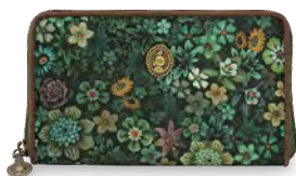
51.273.359 Wallet 18x3x11 cm Tutti i Fiori Green 50% Polyester - 40% PVC - 10% PU Compartment: 1 - Pockets: 5 Fits 5 cards 1/60