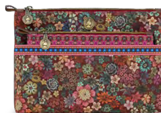
51.274.222 Cosmetic Bag Combi 26x7.5x18 cm/22x1x13 cm Tutti i Fiori Pink 60% Polyester - 40% PVC Compartments: 2 - Pockets: 2 - Ltr: 1.5 1/12