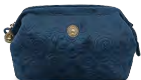
51.274.215 Cosmetic Purse Small 19x8.5x12 cm Velvet Quiltey Days Blue 60% Polyester Velvet - 40% PVC Compartment: 1 - Pockets: 2 - Ltr: 1 1/36