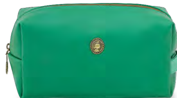
NEW | 51.274.246 Coco Cosmetic Bag Large 26x12x12.6 cm Green 40% PU - 30% PVC - 30% Polyester Compartment: 1 - Pockets: 2 - Ltr: 3 1/18