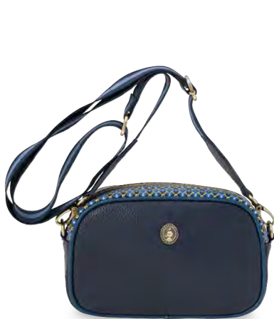
NEW | 51.273.370 Frida Cross Body Bag Small 21x6x13 cm Blue 40% PU - 30% PVC - 30% Polyester Compartment: 1 - Pockets: 2 - Ltr: 1.2 Detachable strap 1/24