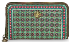
51.273.360 Wallet 18x3x11 cm Clover Green 60% PVC - 20% PU - 20% Polyester Compartment: 1 - Pockets: 5 Fits 5 cards 1/60