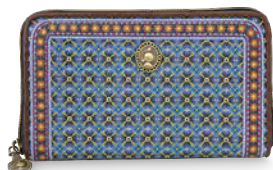
51.273.350 Wallet 18x3x11 cm Clover Blue 60% PVC - 20% PU - 20% Polyester Compartment: 1 - Pockets: 5 Fits 5 cards 1/60