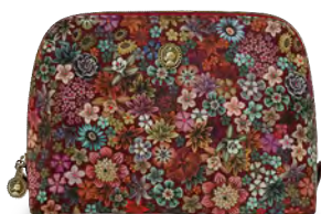
NEW | 51.274.240 Coby Cosmetic Bag Triangle Medium 24/17x8x16.5 cm Tutti i Fiori Pink 60% Polyester - 40% PVC Compartment: 1 - Pockets: 3 - Ltr: 1.2 1/24