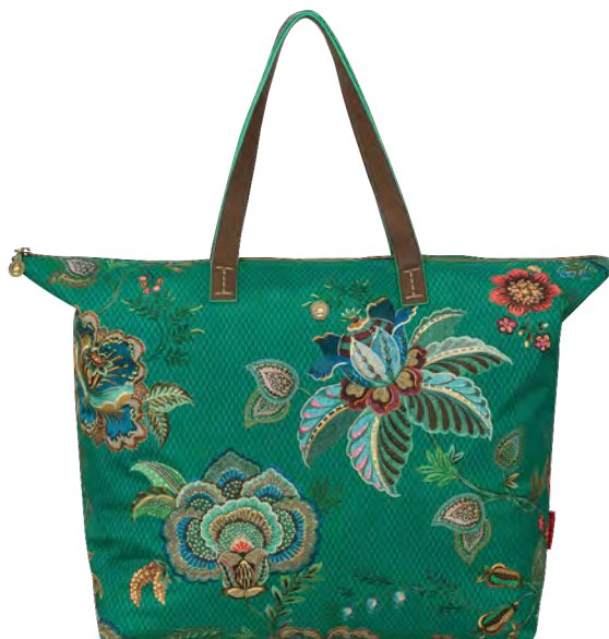
NEW | 51.273.392 Tilda Tote Bag 66x20x44 cm Cece Fiore Green 60% Polyester - 30% PVC - 10% PU Compartment: 1 - Pockets: 3 - Ltr: 17 1/24