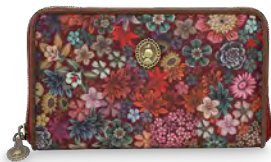
51.273.354 Wallet 18x3x11 cm Tutti i Fiori Pink 50% Polyester - 40% PVC - 10% PU Compartment: 1 - Pockets: 5 Fits 5 cards 1/60