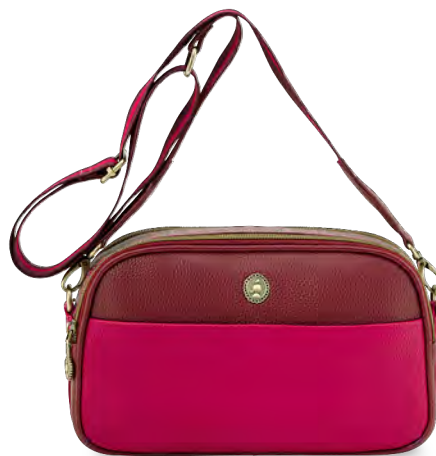
NEW | 51.273.380 Frida Cross Body Bag Medium 26.5x7.5x16.5 cm Red 40% PU - 30% PVC - 30% Polyester Compartments: 2 - Pockets: 2 - Ltr: 2.5 Detachable strap 1/16