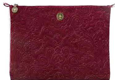
51.274.191 Cosmetic Flat Pouch Large 30x1x22 cm Velvet Quiltey Days Red 60% Polyester Velvet - 40% PVC Compartment: 1 - Pocket: 1 - Ltr: 0.4 1/60