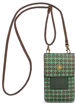
51.273.358 Phone Bag 11x1x18 cm Clover Green 90% PVC - 10% PU Compartment: 1 - Pocket: 1 - Ltr: 0.1 Detachable strap 1/48