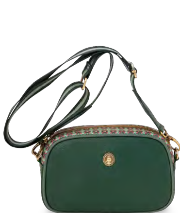
NEW | 51.273.388 Frida Cross Body Bag Small 21x6x13 cm Green 40% PU - 30% PVC - 30% Polyester Compartment: 1 - Pockets: 2 - Ltr: 1.2 Detachable strap 1/24