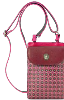
NEW | 51.273.378 Pippa Phone Bag 13.5x3x20 cm Clover Pink 40% PU - 30% PVC - 30% Polyester Compartments: 3 - Pocket: 1 - Ltr: 0.1 Fits 3 cards 1/48