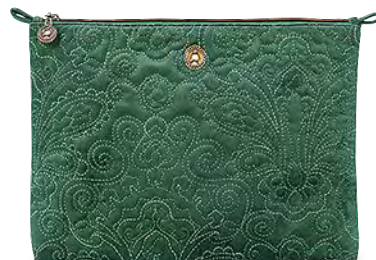
51.274.176 Cosmetic Flat Pouch Large 30x1x22 cm Velvet Quiltey Green 60% Polyester Velvet - 40% PVC Compartment: 1 - Pocket: 1 - Ltr: 0.4 1/60