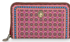
51.273.355 Wallet 18x3x11 cm Clover Pink 60% PVC - 20% PU - 20% Polyester Compartment: 1 - Pockets: 5 Fits 5 cards 1/60