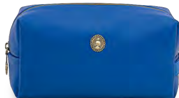
NEW | 51.274.230 Coco Cosmetic Bag Large 26x12x12.6 cm Blue 40% PU - 30% PVC - 30% Polyester Compartment: 1 - Pockets: 2 - Ltr: 3 1/18