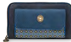
NEW | 51.273.368 Wally Wallet Pocket 19.5x4.5x11 cm Blue 40% PU - 30% PVC - 30% Polyester Compartment: 2 - Pockets: 3 Fits 16 cards 1/60