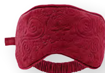
51.530.009 Sleeping Mask One size Velvet Quiltey Days Red 100% Polyester Velvet 1/200