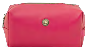
NEW | 51.274.238 Coco Cosmetic Bag Large 26x12x12.6 cm Pink 40% PU - 30% PVC - 30% Polyester Compartment: 1 - Pockets: 2 - Ltr: 3 1/18