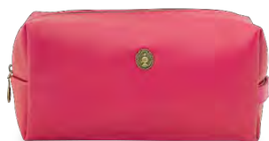
NEW | 51.274.237 Coco Cosmetic Bag Medium 21.5x10x10.5 cm Pink 40% PU - 30% PVC - 30% Polyester Compartment: 1 - Pockets: 2 - Ltr: 1.5 1/24