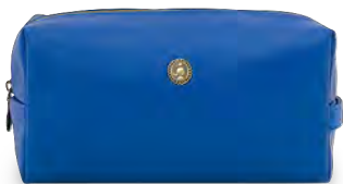
NEW | 51.274.229 Coco Cosmetic Bag Medium 21.5x10x10.5 cm Blue 40% PU - 30% PVC - 30% Polyester Compartment: 1 - Pockets: 2 - Ltr: 1.5 1/24