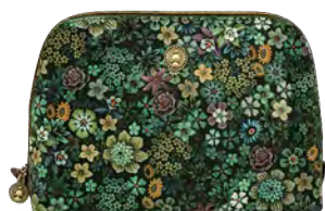
NEW | 51.274.248 Coby Cosmetic Bag Triangle Medium 24/17x8x16.5 cm Tutti i Fiori Green 60% Polyester - 40% PVC Compartment: 1 - Pockets: 3 - Ltr: 1.2 1/24