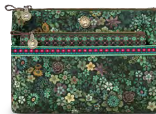
51.274.225 Cosmetic Bag Combi 26x7.5x18 cm/22x1x13 cm Tutti i Fiori Green 60% Polyester - 40% PVC Compartments: 2 - Pockets: 2 - Ltr: 1.5 1/12