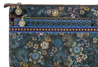
51.274.219 Cosmetic Bag Combi 26x7.5x18 cm/22x1x13 cm Tutti i Fiori Blue 60% Polyester - 40% PVC Compartment: 2 - Pockets: 2 - Ltr: 1.5 1/12