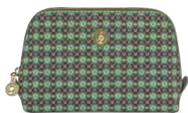
NEW | 51.274.247 Coby Cosmetic Bag Triangle Small 19/15x6x12 cm Clover Green 60% Polyester - 40% PVC Compartment: 1 - Pockets: 2 - Ltr: 0.5 1/36