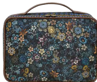
51.274.220 Beauty Case Square Large 27x10x19 cm Tutti i Fiori Blue 60% PVC - 40% Polyester Compartment: 2 - Pockets: 2 - Ltr: 4 1/12