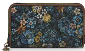
51.273.349 Wallet 18x3x11 cm Tutti i Fiori Blue 50% Polyester - 40% PVC - 10% PU Compartment: 1 - Pockets: 5 Fits 5 cards 1/60