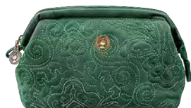
51.274.173 Cosmetic Purse Small 19x8.5x12 cm Velvet Quiltey Green 60% Polyester Velvet - 40% PVC Compartment: 1 - Pockets: 2 - Ltr: 1 1/36