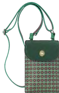
NEW | 51.273.387 Pippa Phone Bag 13.5x3x20 cm Clover Green 40% PU - 30% PVC - 30% Polyester Compartment: 3 - Pocket: 1 - Ltr: 0.1 Fits 3 cards 1/48