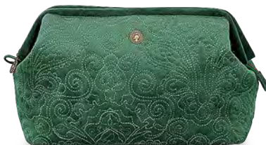
51.274.175 Cosmetic Purse Extra Large 30x13.8x20.7 cm Velvet Quiltey Green 60% Polyester Velvet - 40% PVC Compartment: 1 - Pockets: 3 - Ltr: 6 1/16