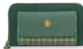
NEW | 51.273.386 Wally Wallet Pocket 19.5x4.5x11 cm Green 40% PU - 30% PVC - 30% Polyester Compartment: 2 - Pockets: 3 Fits 16 cards 1/60