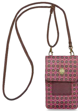
51.273.353 Phone Bag 11x1x18 cm Clover Pink 90% PVC - 10% PU Compartment: 1 - Pocket: 1 - Ltr: 0.1 Detachable strap 1/48