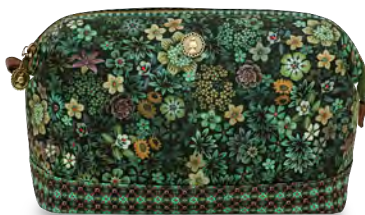
NEW | 51.274.250 Cooper Cosmetic Purse Large 26x12x18 cm Tutti i Fiori Green 60% Polyester - 40% PVC Compartment: 1 - Pockets: 3 - Ltr: 4 1/24