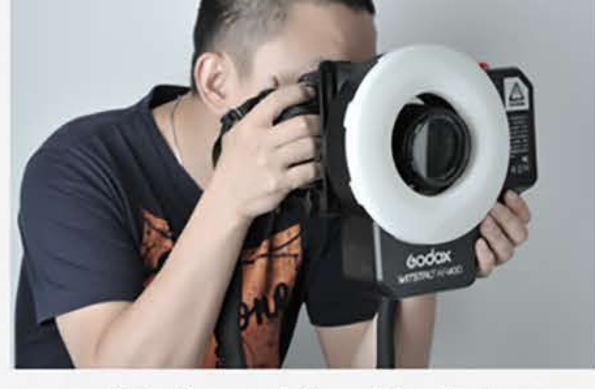
Take it as portable outdoor flash