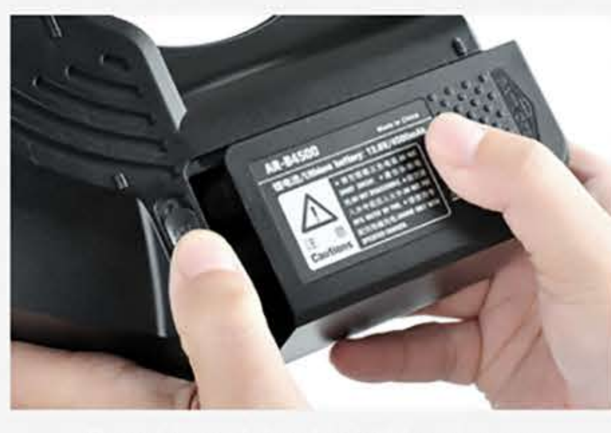
Portable and durable Lithium battery