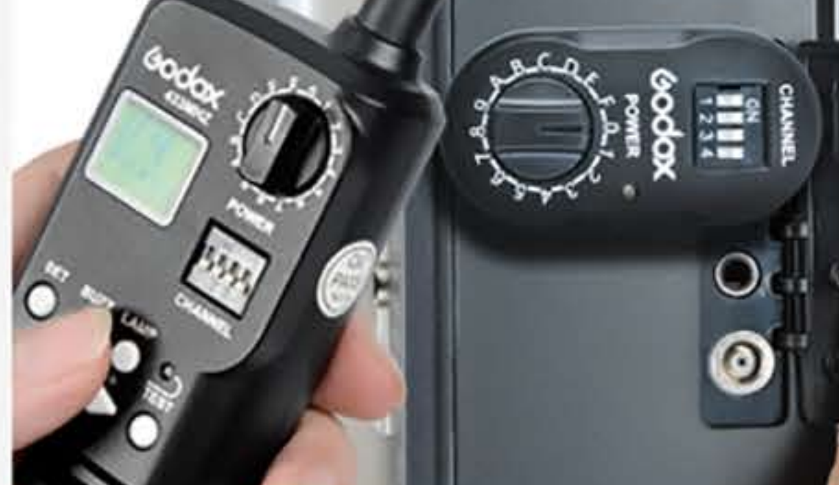
Wireless power adjusting and flash triggering (optional)