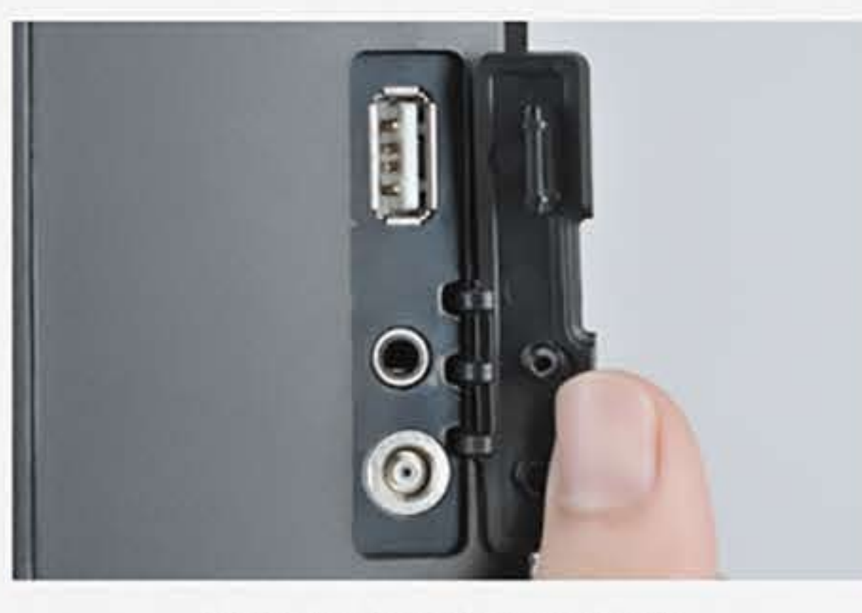
Multiple triggering methods