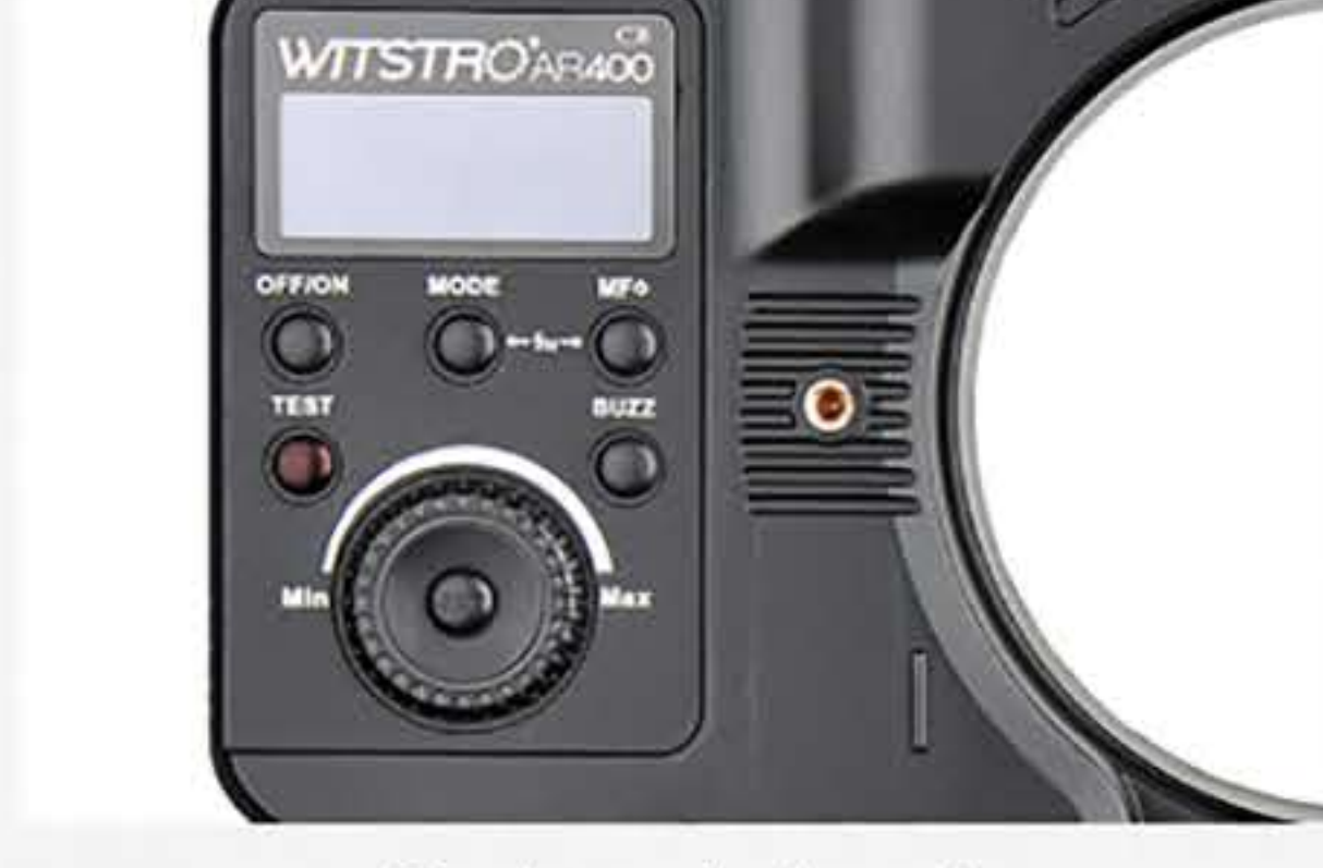
Precise control panel