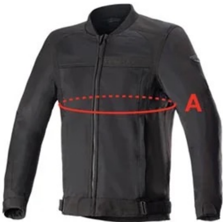
Over the Jacket

If you plan to wear the Tech-Air ® 3 System under the protective jacket, you must take measurement “B” while wearing a base layer.