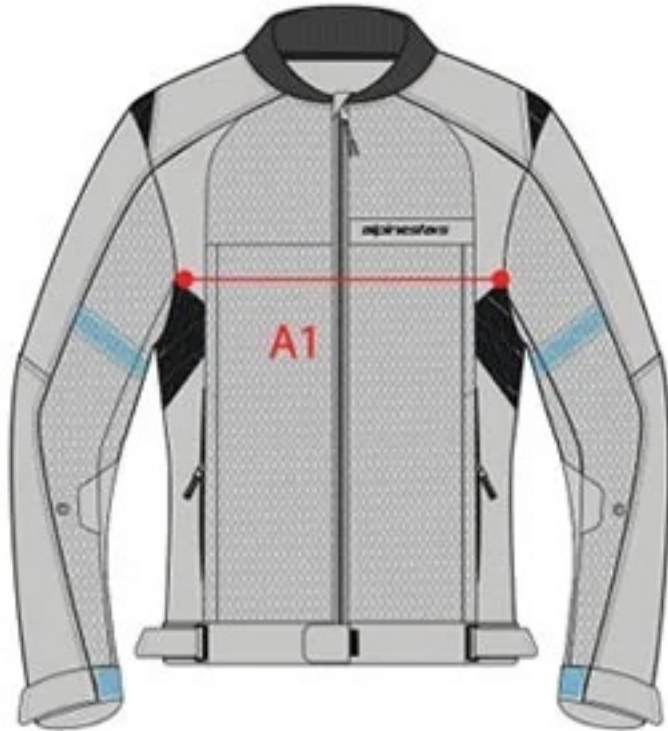
A - circumference of the chest A1 - garment width on the chest region