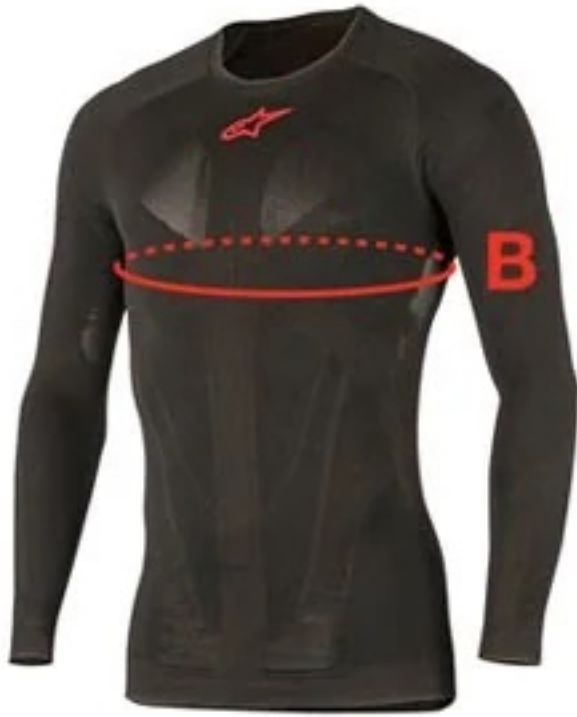
Under the Jacket