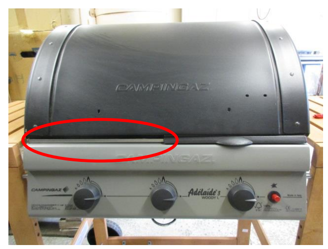
Extra space left when using the old griddle and the new