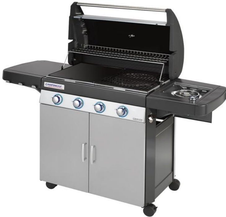
4 SERIES CLASSIC EXS