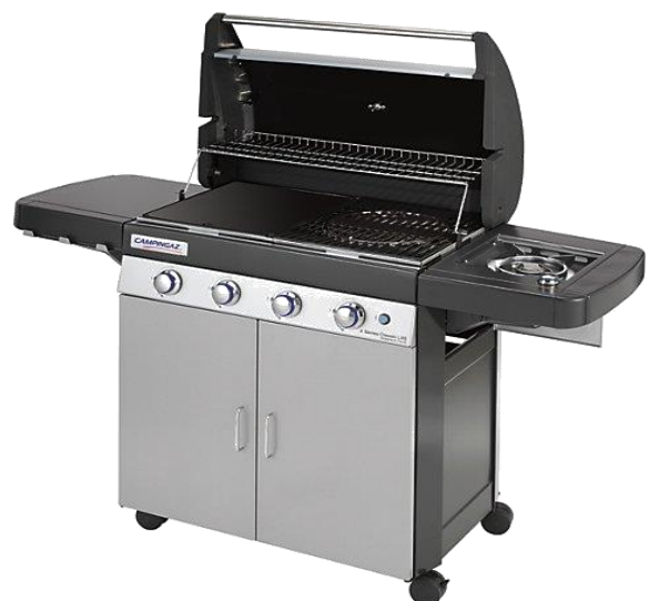
4 SERIES CLASSIC LXS