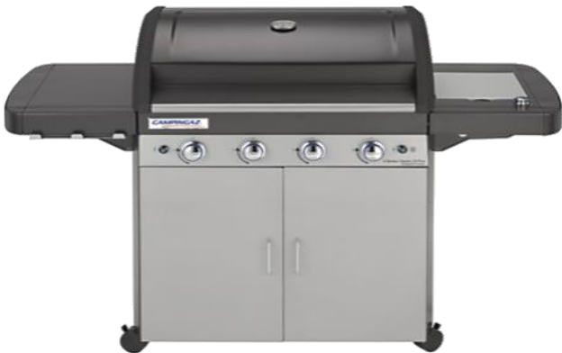
4 SERIES CLASSIC LS 4 SERIES CLASSIC LS PLUS