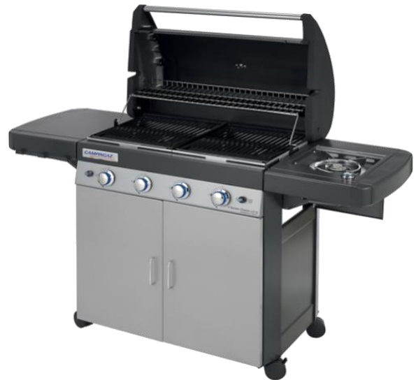
4 SERIES CLASSIC LS G