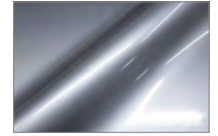
OS-502 Silver Spirit