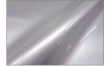
OS-501 Pearl of Wisdom