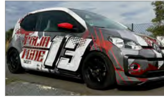
Wrapped by Foliatune, Germany. Printed film: OS-500 White Wonder - Laminate: OS-510 Razor Blade