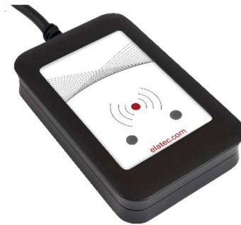
Desktop version (inlay customizable)

Elatec's TWN4 family of transponder readers and writers allows users to read and write to almost any 125 kHz, 134.2 kHz and 13.56 MHz tags and/or labels. It supports all major transponders from various suppliers like ATMEL, EM, ST, NXP, TI, HID etc. and ISO standards like ISO14443A/B (T=CL), ISO15693, ISO18092 / ECMA-340 (NFC).