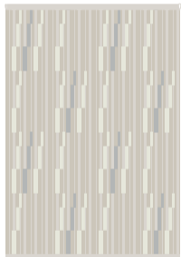
Medium: 114 x 160 cm