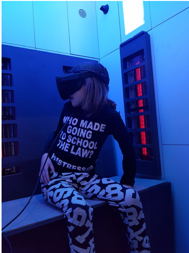
Figure 2 Inside the Pod.

the cabin is not simple either. The 'Pod care' has a physical component that requires (elderly, handicapped, confused) bodies to be placed in a particular position – and remain there. The VR goggles must be put on faces just right, buttons on the screen must be touched, the sound must be tested; objects and bodies must fit together; restless, confused, difficult bodies must