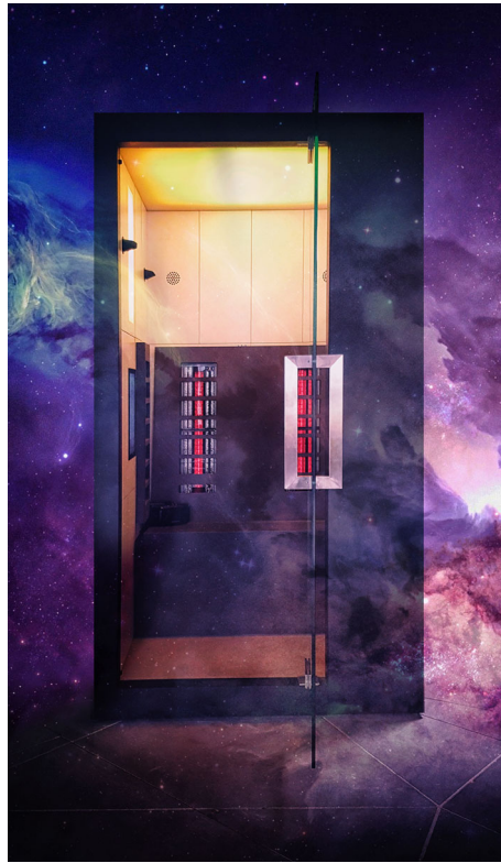
Figure 4 The Pod as an aesthetic of 'good care'.

choice, but rather a particular way of structuring that freedom. The ideology of autonomy is articulated through the idea that everything is possible (in the Pod, in post-place more generally), which reveals an urgency to make post-place care a matter of concern (Latour 2004).