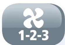
4 fan speed settings