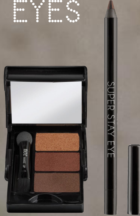
EYESHADOW TRIO SOPHI