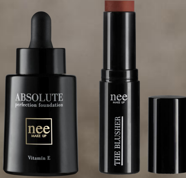
ABSOLUTE FOUNDATION WARM BEIGE