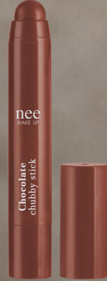
CHUBBY STICK CHOCOLATE