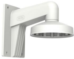
DS-1273ZJ-DM32 Wall Mount