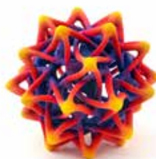
VisiJet PXL + Wax infiltrant for fast, affordable, beautiful color models