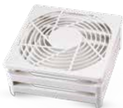
VisiJet PXL + Salt Water infiltrant, ideal for veryeconomical monochrome models

Choose from a range of finishing options to meet your application requirements, from ColorBond infiltration for stronger functional prototypes to wax for creating concept models quickly, safely and affordably.