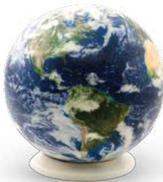
Multi-color globe model 3D printed with gradient blending.

Warranty/Disclaimer: The performance characteristics of these products may vary according to product application, operating conditions, material combined with, or with end use. 3D Systems makes no warranties of any type, express or implied, including, but not limited to, the warranties of merchantability or fitness for a particular use.