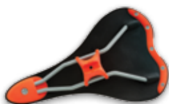
VisiJet PXL + ColorBond infiltrant for improved strength and color vibrancy of this bicycle seat model