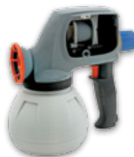
VisiJet PXL + StrengthMax infiltrant to dramatically improve the strength of this paint gun ergonomic prototype