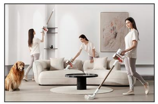
New 3+1 functional brush head set