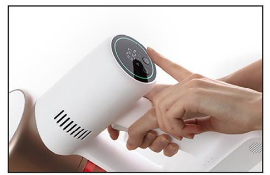
One-button self-locking design