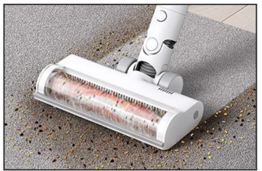
Ultra-long battery life