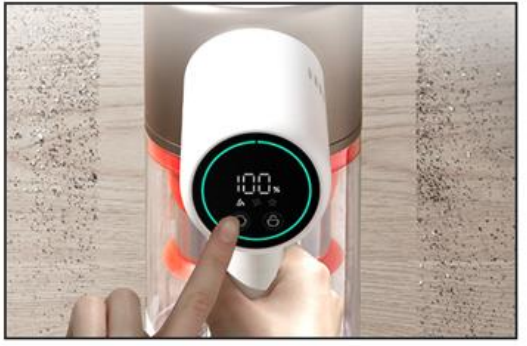
High-quality LED operation interface