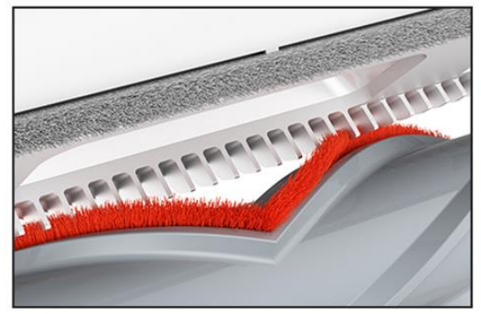
Roller brush with anti-entanglement design