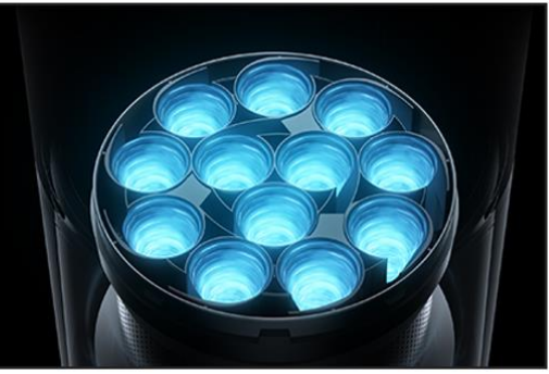
12-cone cyclone dust-separation system