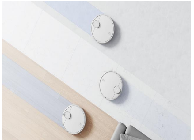
Three water settings