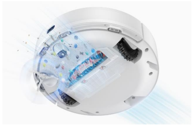
4000Pa powerful suction fan blower