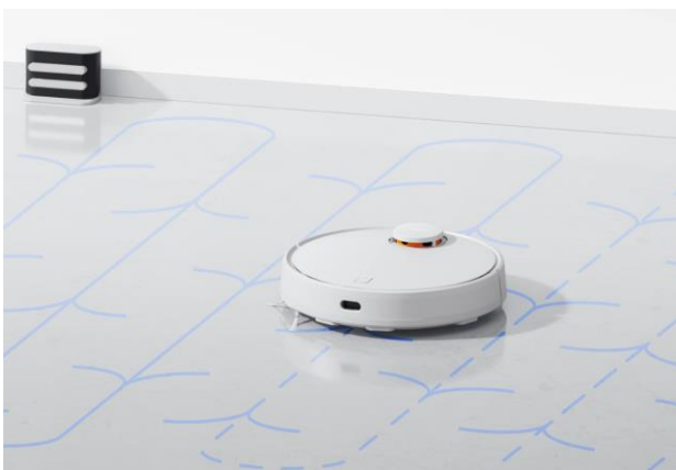
Zigzag and Y-shape cleaning routes