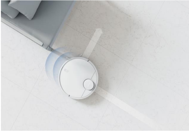
LDS laser navigation system