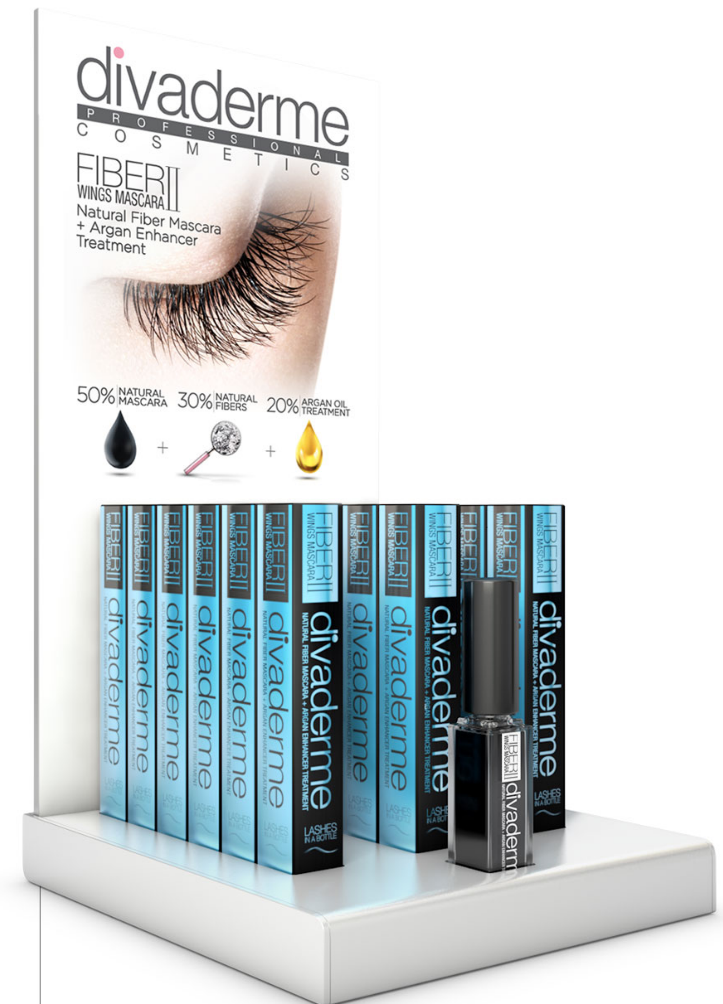
FIBER II WINGS MASCARA II DISPLAY 18 UNITS + 1 TESTER