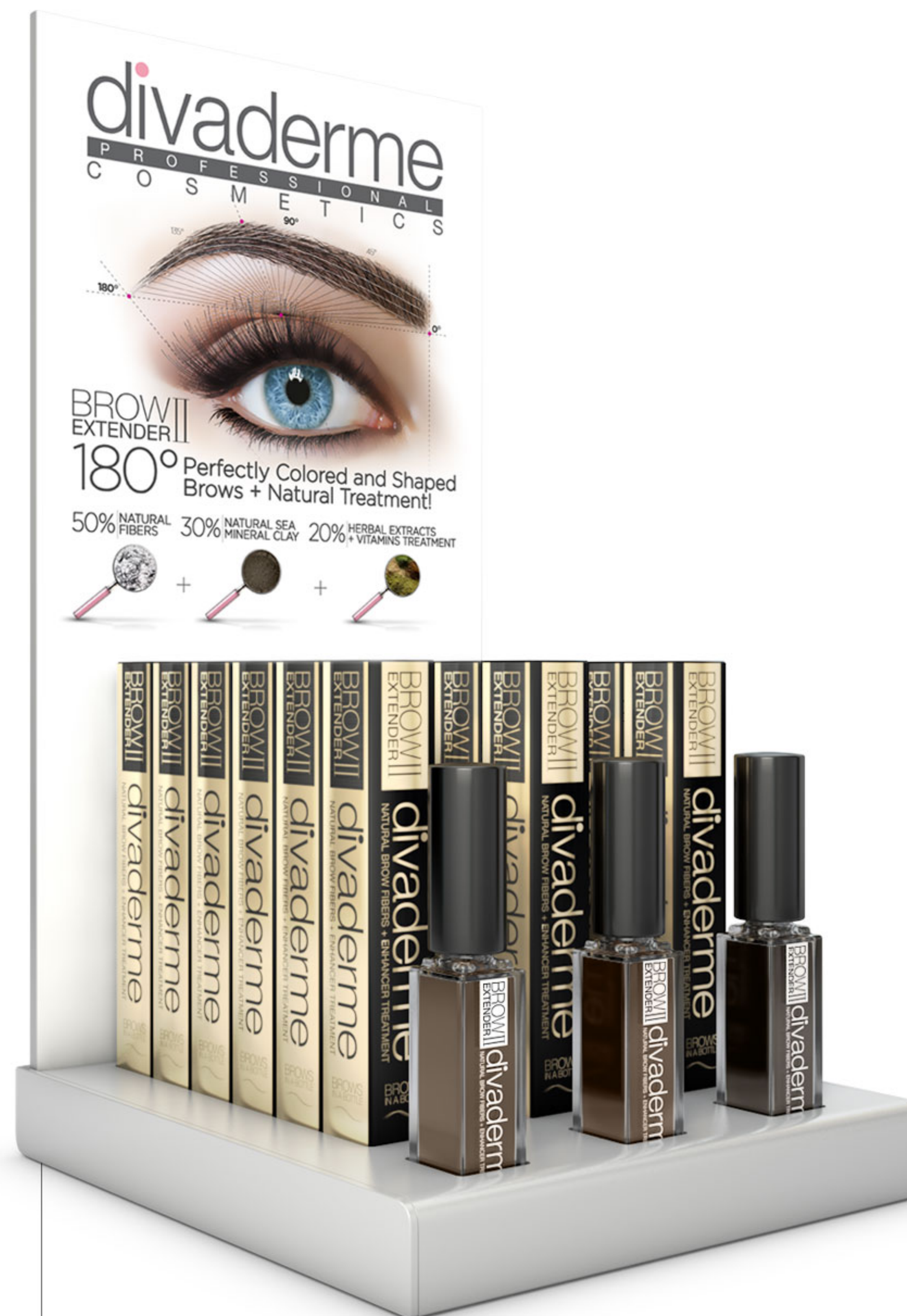
BROW II EXTENDER II DISPLAY 18 UNITS + 3 TESTERS