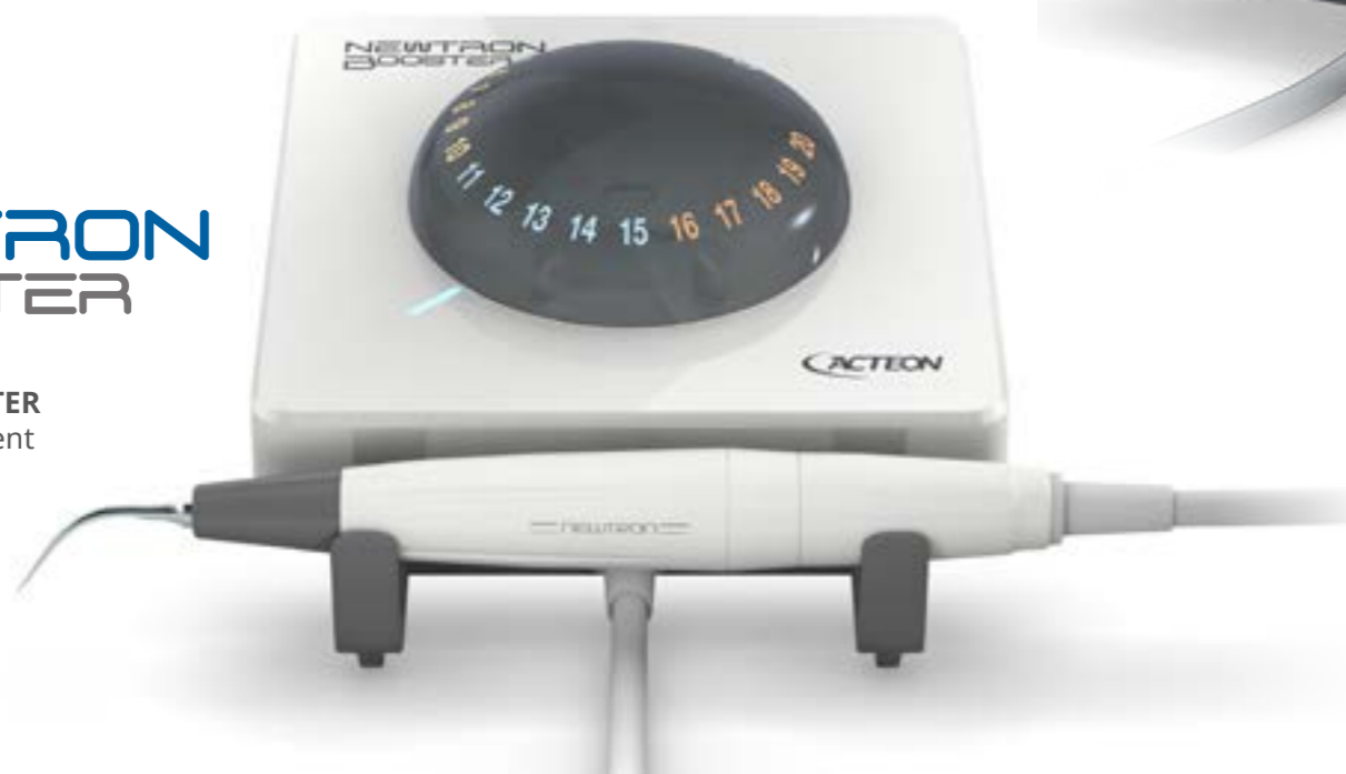
NEWTRON® BOOSTER Compact and efficient