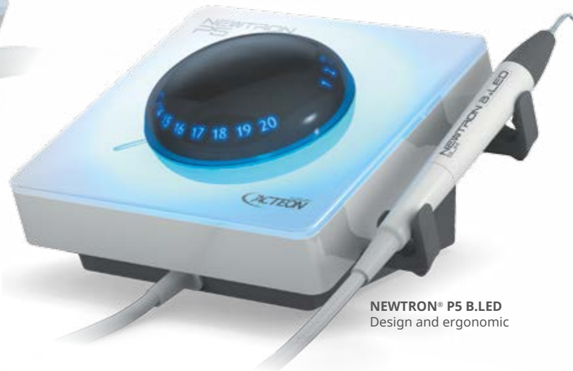
NEWTRON® P5 B.LED Design and ergonomic