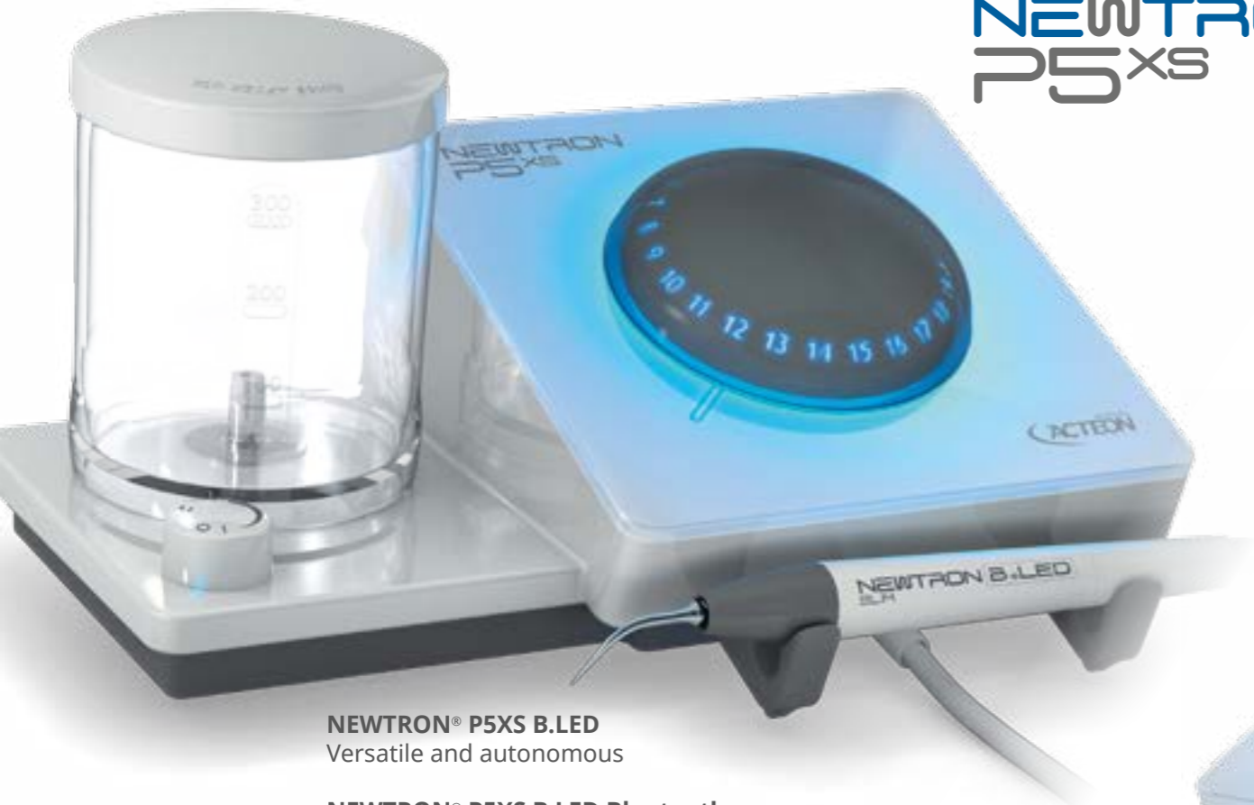
NEWTRON® P5XS B.LED Versatile and autonomous