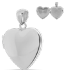
AH 049.FP Glossy H 2.8 cm