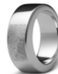
R 033.8.FP Glossy W 0.8 cm