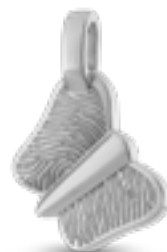
HF 112.180 Glossy H 2.5 cm