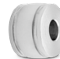
MB 007 Glossy H 1.4 cm