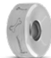
DMB 003 Matt H 1.4 cm