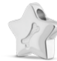
DH 206 Glossy H 1.6 cm