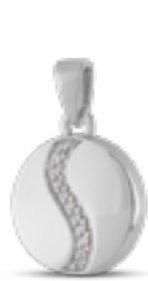
AH 071 Glossy H 2.5 cm In silver with zirconium gems, in gold with diamonds