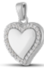
AH 073 Glossy H 2.4 cm In silver with zirconium gems, in gold with diamonds