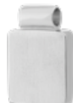
DH 011 Matt H 2.0 cm