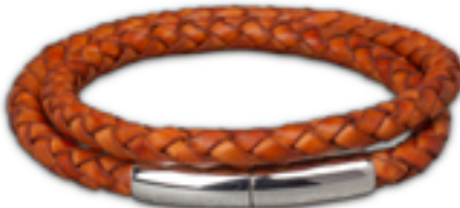
FPU 605 Glossy Length available in: S – M – L – XL