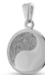
HF 107 Glossy H 2.6 cm