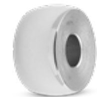
MB 009 Glossy H 1.4 cm