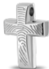
AH 057.FP Glossy H 2.6 cm