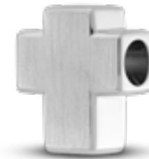
MB 006 Matt H 1.7 cm