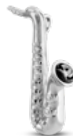
AH 178 Glossy Saxophone H 3.5 cm