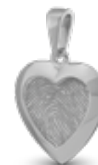
HF 105 Glossy H 2.5 cm