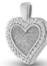
HF 101 Glossy H 2.6 cm In silver with zirconium gems, in gold with diamonds