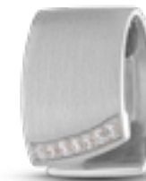
AH 089 Matt H 2.0 cm In silver with zirconium gems, in gold with diamonds