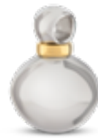
AH 043 Glossy H 2.0 cm Jump ring 14 ct. gold