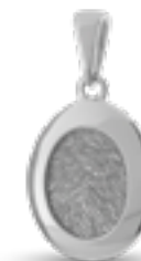
HF 104 Glossy H 2.5 cm