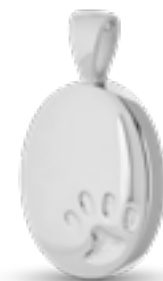
DH 004 Glossy H 3.0 cm