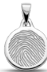
LFP 01-185 Glossy H 2.3 cm