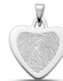
LFP 06-230 Glossy H 2.7 cm