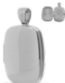
AH 050.FP Glossy H 3.0 cm