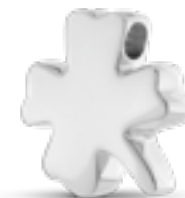
AH 061 Glossy H 1.9 cm