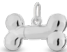
DH 005 Glossy H 1.6 cm