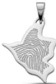
LFP 07-220 Glossy H 2.9 cm