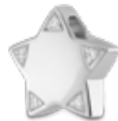
AH 079 Glossy H 1.6 cm In silver with zirconium gems, in gold with diamonds