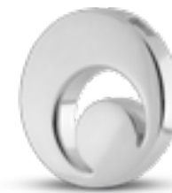
AH 088 Glossy H 2.3 cm