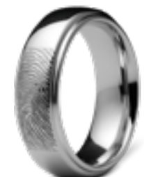
RF 05.6 Glossy W 0.6 cm