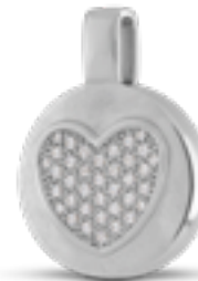
AH 111 Matt H 2.7 cm In silver with zirconium gems, in gold with diamonds