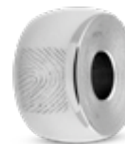
MB 009.FP Glossy H 1.4 cm