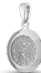
HF 103 Glossy H 2.5 cm