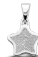
LFP 05-150 Glossy H 2.0 cm