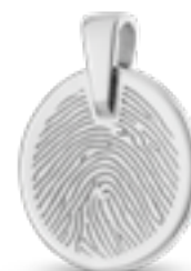
HF 108.180 Glossy H 2.2 cm