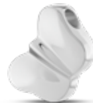
AH 060 Glossy H 2.0 cm