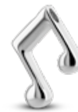
AH 172 Glossy Double eighth note H 2.5 cm