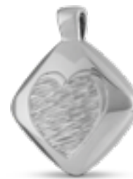
AH 123 Glossy H 2.5 cm