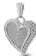
HF 102 Glossy H 2.5 cm In silver with zirconium gems, in gold with diamonds