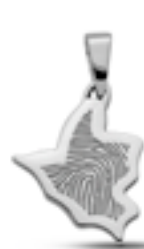
LFP 07-140 Glossy H 2.1 cm