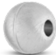
AH 076 Matt H 1.8 cm