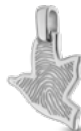
HF 111.190 Glossy H 2.4 cm