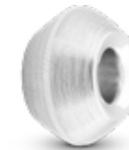
MB 001 Matt H 1.4 cm