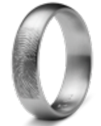
RF 01.6M Matt W 0.6 cm