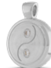
AH 112 Matt H 2.3 cm DUO - 2 ash chambers En plata con circonita, en oro con diamante