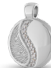
HF 099 Glossy H 2.3 cm In silver with zirconium gems, in gold with diamonds