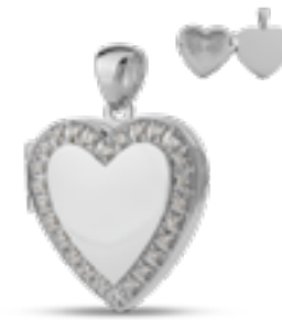
AH 048 Glossy H 2.8 cm In silver with zirconium gems, in gold with diamonds