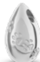
DH 207 Glossy H 1.9 cm