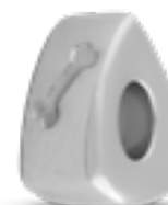
DMB 004 Glossy H 1.3 cm