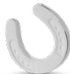
DH 009 Matt H 2.5 cm