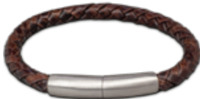
FPU 604 Matt Length available in: S – M – L – XL