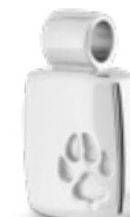
DH 208 Glossy H 2.3 cm