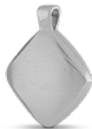
AH 122 Matt H 2.5 cm