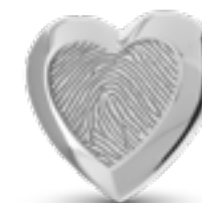
HF 097 Glossy H 1.9 cm