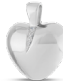
AH 070 Glossy H 2.8 cm DUO - 2 ash chambers In silver with zirconium gems, in gold with diamonds