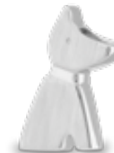
DH 017 Matt H 2.1 cm