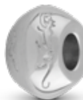
DMB 005 Glossy H 1.4 cm