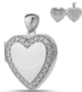
AH 048.FP Glossy H 2.8 cm In silver with zirconium gems, in gold with diamonds