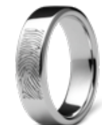
RF 02.8 Glossy W 0.8 cm