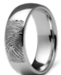
RF 04.7 Glossy W 0.7 cm