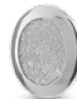
HF 096 Glossy H 1.9 cm