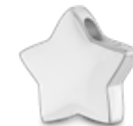
AH 054 Glossy H 1.6 cm