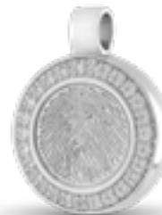
HF 100 Glossy H 2.4 cm In silver with zirconium gems, in gold with diamonds