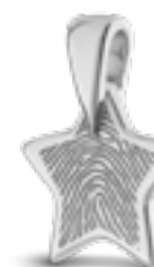
HF 110.160 Glossy H 2.0 cm