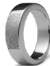
R 033.6.FP Glossy W 0.6 cm