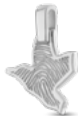
HF 111.175 Glossy H 2.2 cm