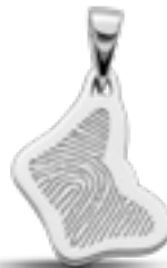
LFP 08-185 Glossy H 2.4 cm