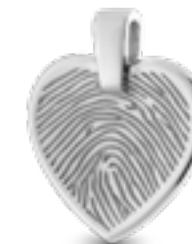
HF 109.170 Glossy H 2.1 cm