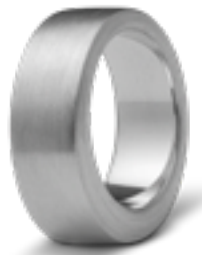
R 033.8M Matt W 0.8 cm