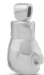
AH 157 Glossy Boxing glove H 2.3 cm