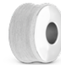
MB 002 Matt H 1.4 cm