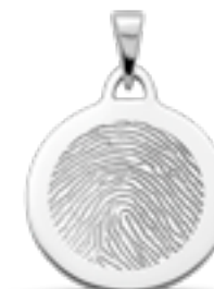
LFP 01-230 Glossy H 2.7 cm