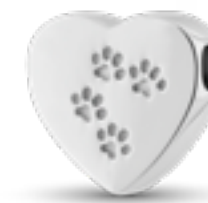
DH 205 Glossy H 1.6 cm