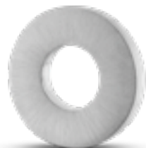
AH 040 Matt H 2.1 cm