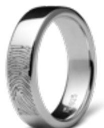
RF 03.6 Glossy W 0.6 cm