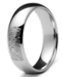
RF 01.6 Glossy W 0.6 cm

Atlantis Memorials also offers an extensive collection of fingerprint jewellery without an ash chamber, suitable for both him and her. Fashionable, elegant rings that tell the life story of a loved one through a personal fingerprint. Using a special laser, this print is engraved deep into the jewellery. In this way, a high-quality print can be achieved, suitable for daily use. In addition, each piece of jewellery is provided with an extra layer of silver or gold for finishing and reinforcement. The rings are available in both a glossy and matte finish.