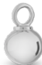
DH 006 Glossy H 1.7 cm