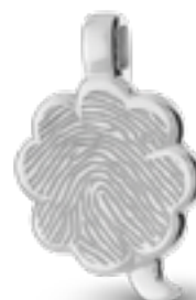
HF 115.185 Glossy H 2.7 cm