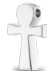
AH 056 Glossy H 2.8 cm