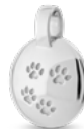
DH 201 Glossy H 2.3 cm