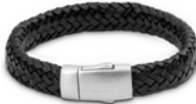
FPU 608 Matt Length available in: S – M – L – XL