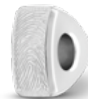
MB 004.FP Matt H 1.3 cm