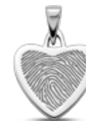
LFP 06-185 Glossy H 2.3 cm