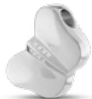
AH 083 Glossy H 2.0 cm In silver with zirconium gems, in gold with diamonds