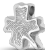
AH 061.FP Glossy H 1.9 cm