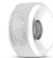
MB 003.FP Matt H 1.4 cm