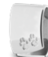
DH 209 Glossy H 1.8 cm