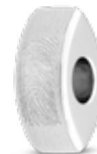
MB 005.FP Matt H 1.6 cm