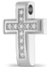
AH 081 Glossy H 2.6 cm In silver with zirconium gems, in gold with diamonds