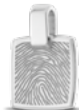
HF 116.140 Glossy H 1.9 cm