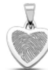
LFP 06-155 Glossy H 2.0 cm