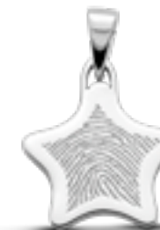
LFP 05-190 Glossy H 2.3 cm