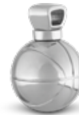
AH 152 Glossy Basketball H 2.2 cm