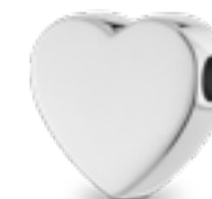
AH 053 Glossy H 1.6 cm