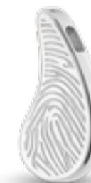
HF 117.260 Glossy H 2.6 cm