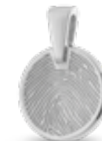
HF 108.140 Glossy H 2.0 cm