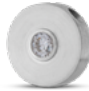
AH 075 Matt H 1.9 cm Both in silver as in gold with zirconium gems