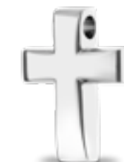
AH 057 Glossy H 2.6 cm