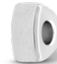
MB 004 Matt H 1.3 cm