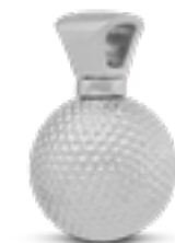
AH 156 Glossy Golf ball H 1.9 cm