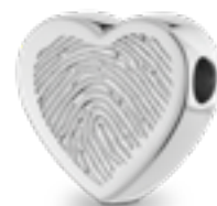
AH 053.FP Glossy H 1.6 cm