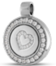
AH 093 Glossy H 2.4 cm In silver with zirconium gems, in gold with diamonds