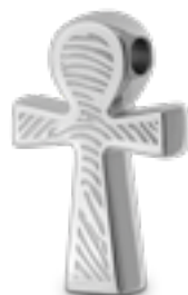
AH 056.FP Glossy H 2.8 cm