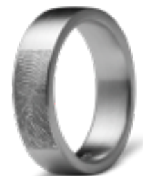
RF 02.8M Matt W 0.8 cm