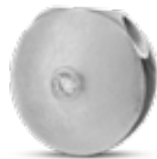
AH 011 Matt H 1.8 cm In silver with zirconium gems, in gold with diamonds