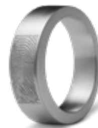
R 033.6.FPM Matt W 0.6 cm