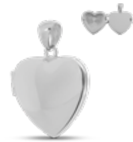
AH 049 Glossy H 2.8 cm