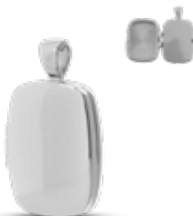
AH 050 Glossy H 3.0 cm