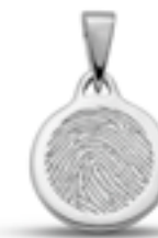
LFP 01-155 Glossy H 2.1 cm