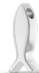
AH 055 Glossy H 2.7 cm