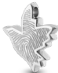
AH 059.FP Glossy H 2.7 cm