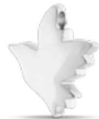
AH 059 Glossy H 2.7 cm