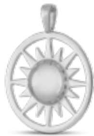
AH 072 Glossy H 3.6 cm