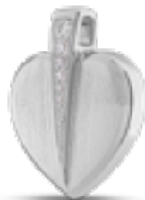
AH 085 Matt H 2.4 cm In silver with zirconium gems, in gold with diamonds