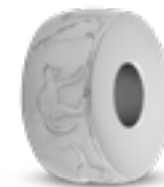
DMB 001 Glossy H 1.4 cm