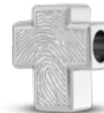
MB 006.FP Matt H 1.7 cm