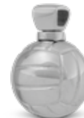
AH 154 Glossy Volleyball H 2.3 cm