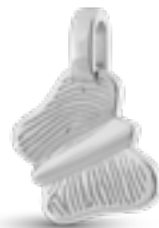
HF 112.150 Glossy H 2.1 cm