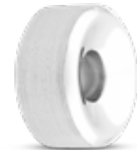
MB 003 Matt H 1.4 cm