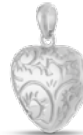
AH 069 Glossy H 2.8 cm