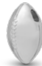
AH 151 Glossy American Football H 2.1 cm