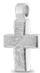
HF 114.180 Glossy H 2.4 cm