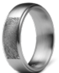
RF 05.6M Matt W 0.6 cm