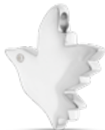
AH 082 Glossy H 2.7 cm In silver with zirconium gems, in gold with diamonds