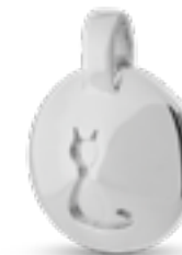
DH 200 Glossy H 2.2 cm