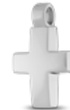
AH 116 Glossy H 2.3 cm