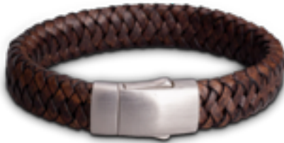
FPU 602 Matt Length available in: S – M – L – XL