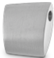
AH 004 Matt H 2.0 cm