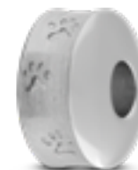
DMB 002 Matt H 1.4 cm