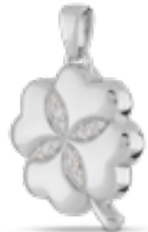
AH 077 Glossy H 2.9 cm In silver with zirconium gems, in gold with diamonds