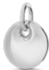
AH 001 Glossy H 2.8 cm