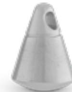
AH 118 Matt H 1.8 cm