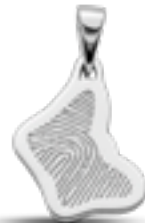
LFP 08-155 Glossy H 2.1 cm