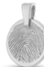
HF 108.160 Glossy H 2.1 cm