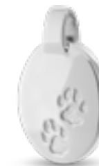
DH 202 Glossy H 2.2 cm