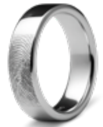
RF 02.6 Glossy W 0.6 cm