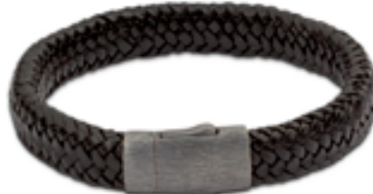
FPU 609 Matt Length available in: S – M – L – XL