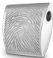
AH 004.FP Matt H 2.0 cm