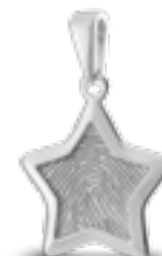
HF 106 Glossy H 2.5 cm