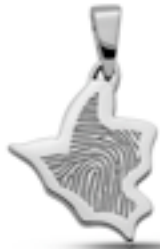
LFP 07-175 Glossy H 2.4 cm