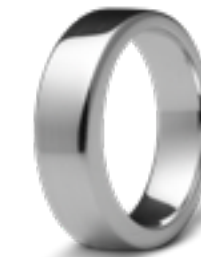
R 033.6 Glossy W 0.6 cm