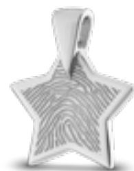
HF 110.185 Glossy H 2.3 cm