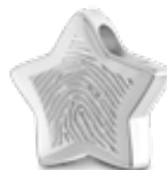
AH 054.FP Glossy H 1.6 cm