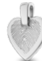
HF 109.145 Glossy H 1.8 cm