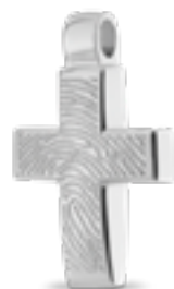
HF 114.210 Glossy H 2.7 cm