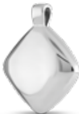
AH 121 Glossy H 2.5 cm