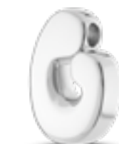
AH 058 Glossy H 2.1 cm