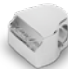
AH 177 Glossy Piano H 1.2 cm