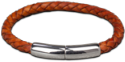
FPU 603 Glossy Length available in: S – M – L – XL