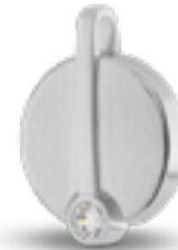
AH 087 Matt H 2.4 cm In silver with zirconium gems, in gold with diamonds