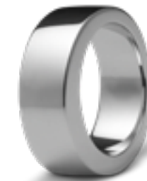
R 033.8 Glossy W 0.8 cm