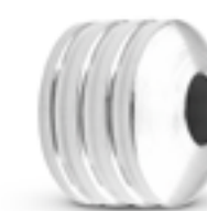
MB 008 Glossy H 1.3 cm