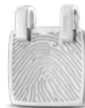
HF 116.175 Glossy H 2.1 cm