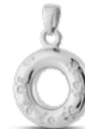
DH 018 Glossy H 2.5 cm