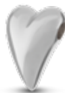
DH 008 Glossy H 1.4 cm