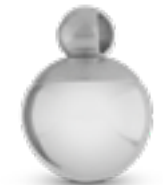
AH 117 Glossy H 1.7 cm