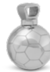
AH 153 Glossy Soccer ball H 2.2 cm