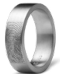
RF 03.6M Matt W 0.6 cm