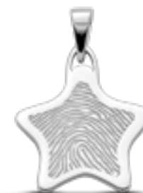
LFP 05-220 Glossy H 2.7 cm