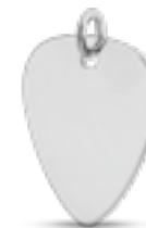
AH 176 Glossy Guitar pick H 2.7 cm Pendant has no ash chamber