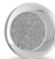
HF 095 Glossy H 1.9 cm