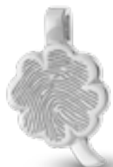
HF 115.165 Glossy H 2.4 cm