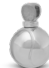
AH 155 Glossy Tennis ball H 1.9 cm