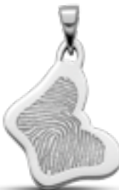
LFP 08-230 Glossy H 2.9 cm