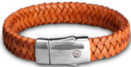
FPU 601 Glossy With zirconium gem. Length available in: S – M – L – XL

The Embrace bracelets are modern pieces of jewellery, made out of authentic braided leather. Leather is an adaptable natural material that gets softer over time and the unique chromatic composition converts each bracelet into an exclusive piece. All bracelets have a 925 Sterling silver push button clasp which accentuates the jewellery's modern look. There is a small space inside the clasp for a symbolic amount of ashes, which closes easily and safely. The end result is an elegant bracelet that offers a subtle way for you to keep the memory of your beloved one with you at all times.