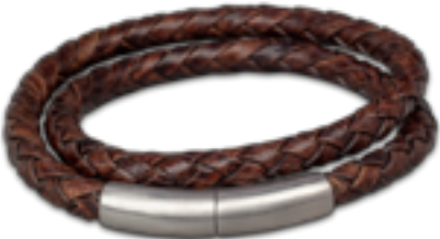
FPU 606 Matt Length available in: S – M – L – XL