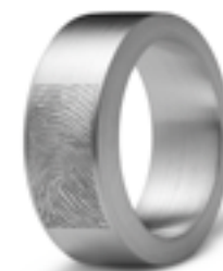
R 033.8.FPM Matt W 0.8 cm