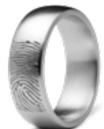
RF 04.7M Matt W 0.7 cm