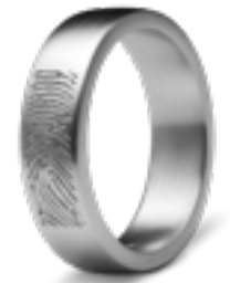
RF 02.6M Matt W 0.6 cm