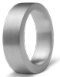
R 033.6M Matt W 0.6 cm