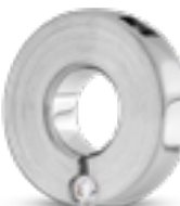
AH 086 Matt H 1.9 cm DUO - 2 ash chambers In silver with zirconium gems, in gold with diamonds