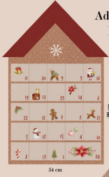
Advent Calendar 1x Pockets 24x