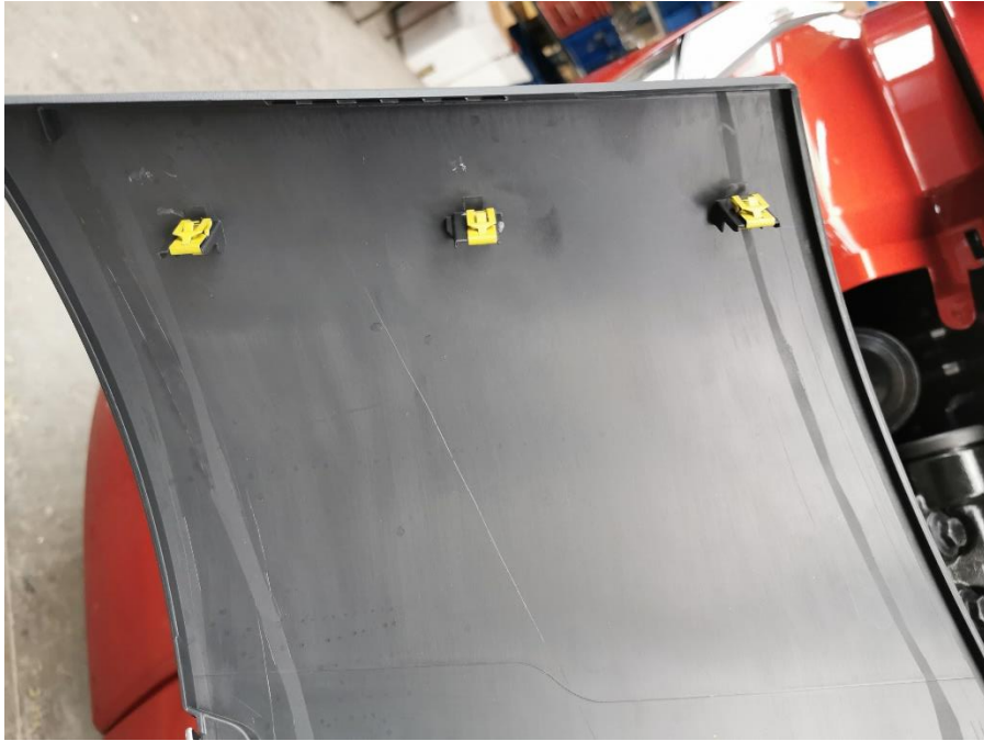
SIDE CLIPS WHEN THE PANEL IS REMOVED