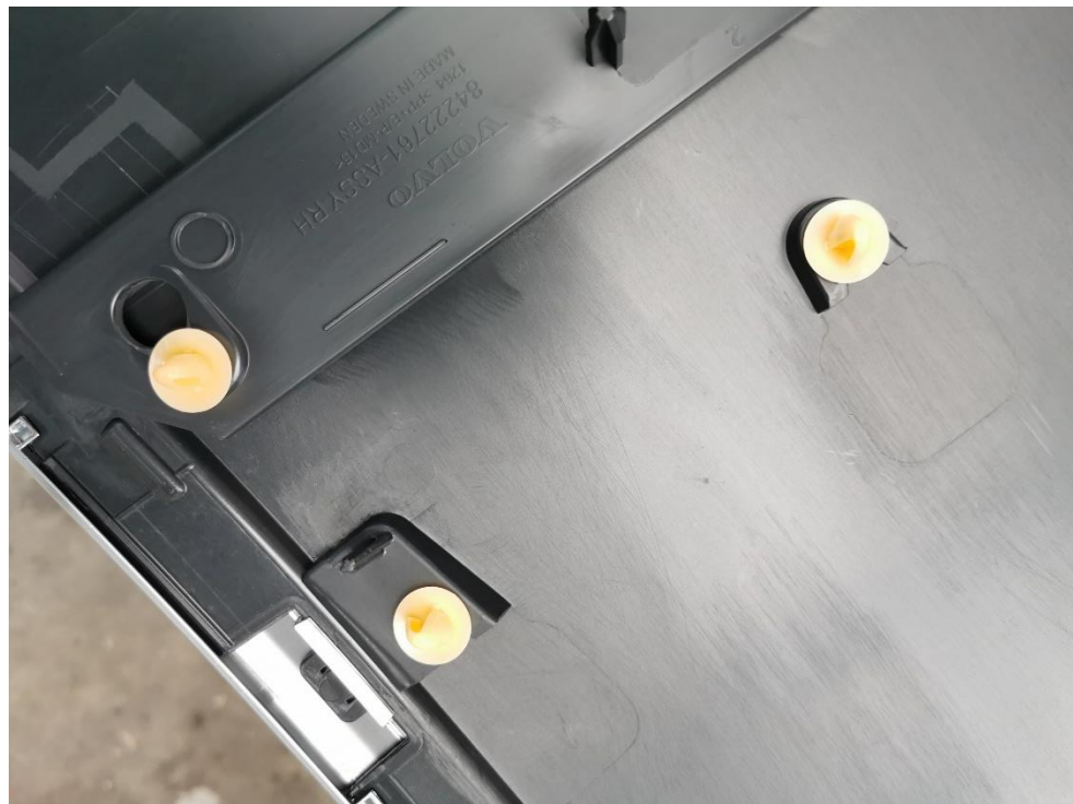
CLIPS AFTER THE PANEL IS REMOVED