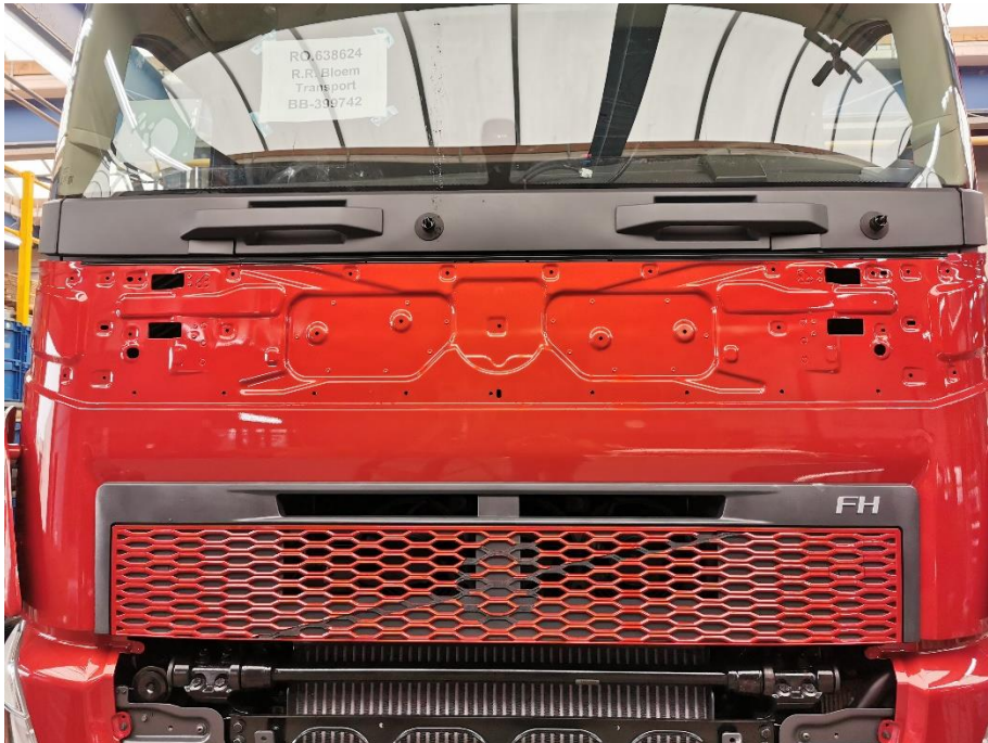
FRONT WITH ALL TOP PANELS REMOVED