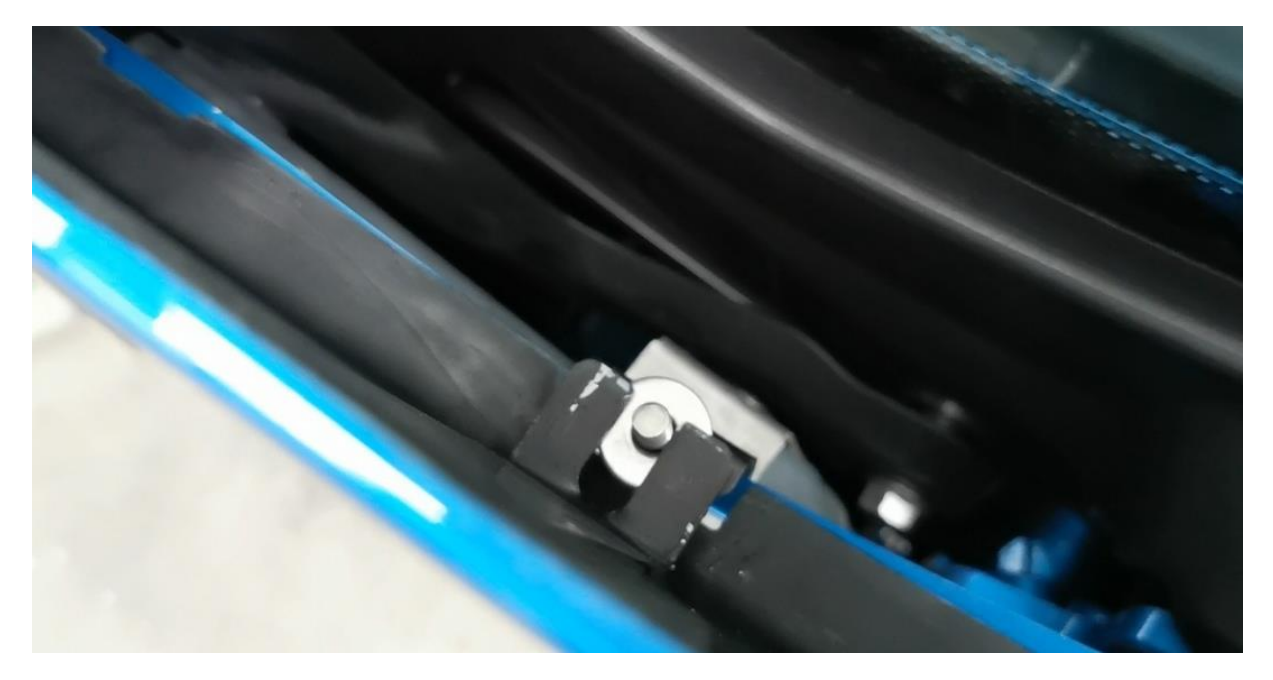
BRACKET POSITION 3 (MIDDLE BRACKET)