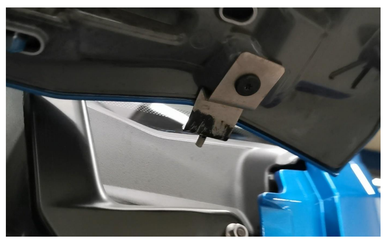
BRACKET POSITION 2 AND 4 (INSIDE VIEW)