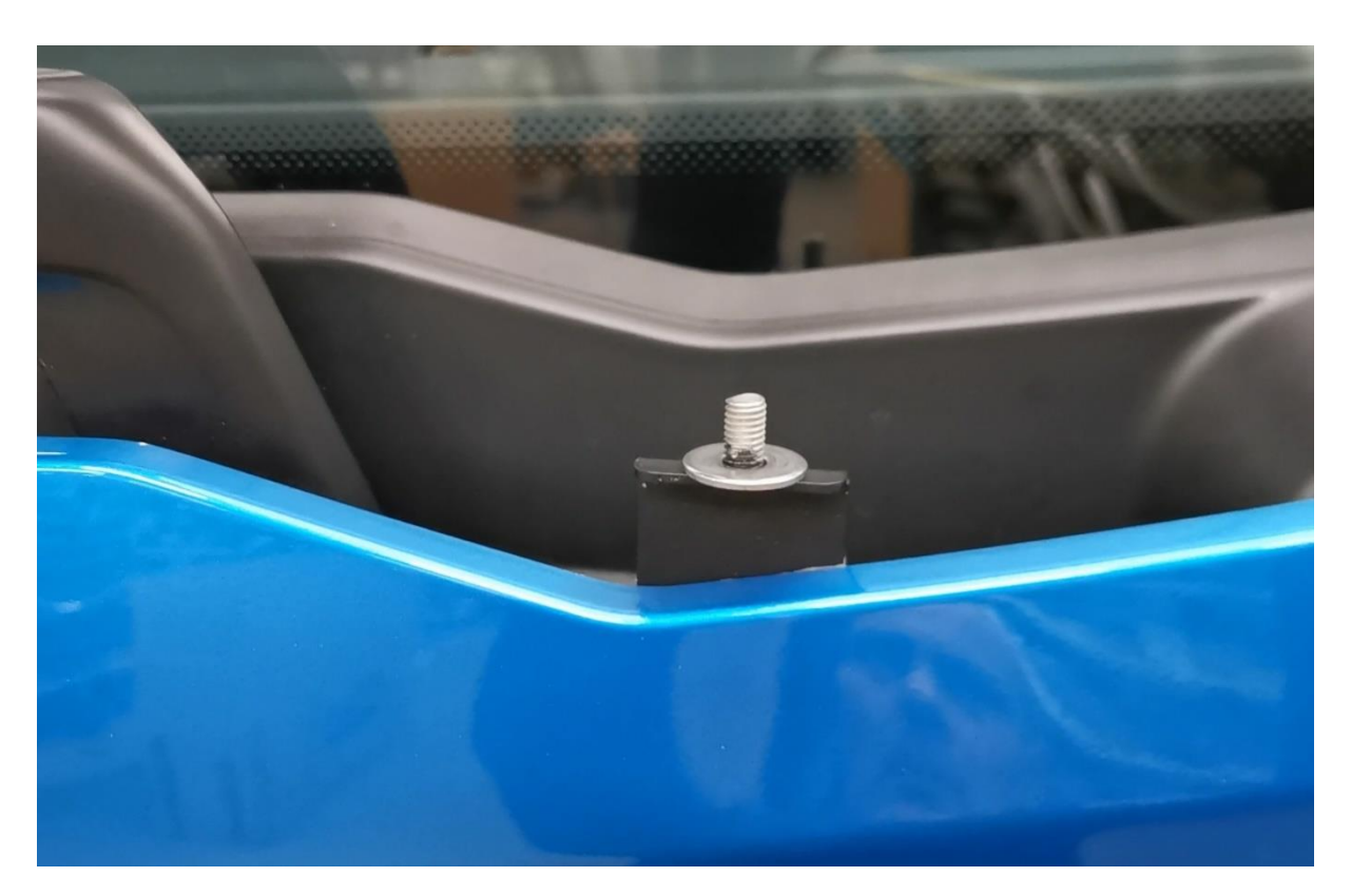
BRACKET POSITION 2 AND 4 ( OUTSIDE VIEW )