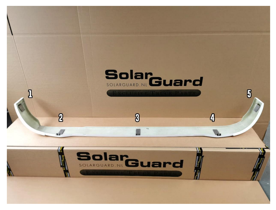
INSTALL THE BRACKETS DELIVERED WITH THE STONEGUARD