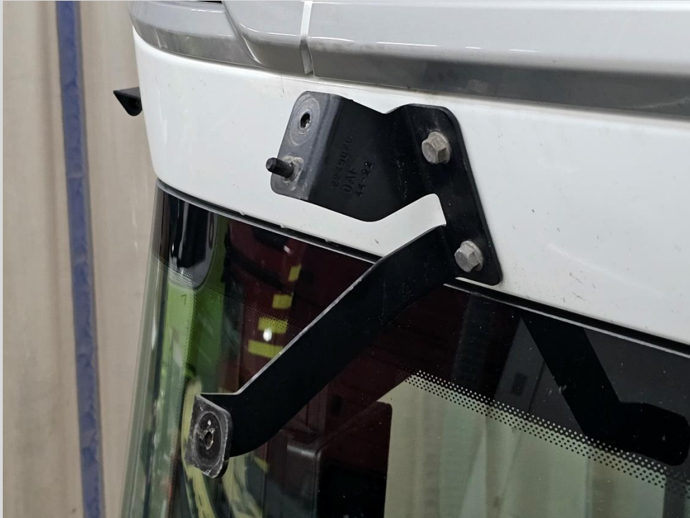
3 CENTRE BRACKETS

REMOVE THE ORIGINAL SUNVISOR COMPLETELY. ONLY THE ORIGINAL BRACKETS REMAIN ON THE CABIN