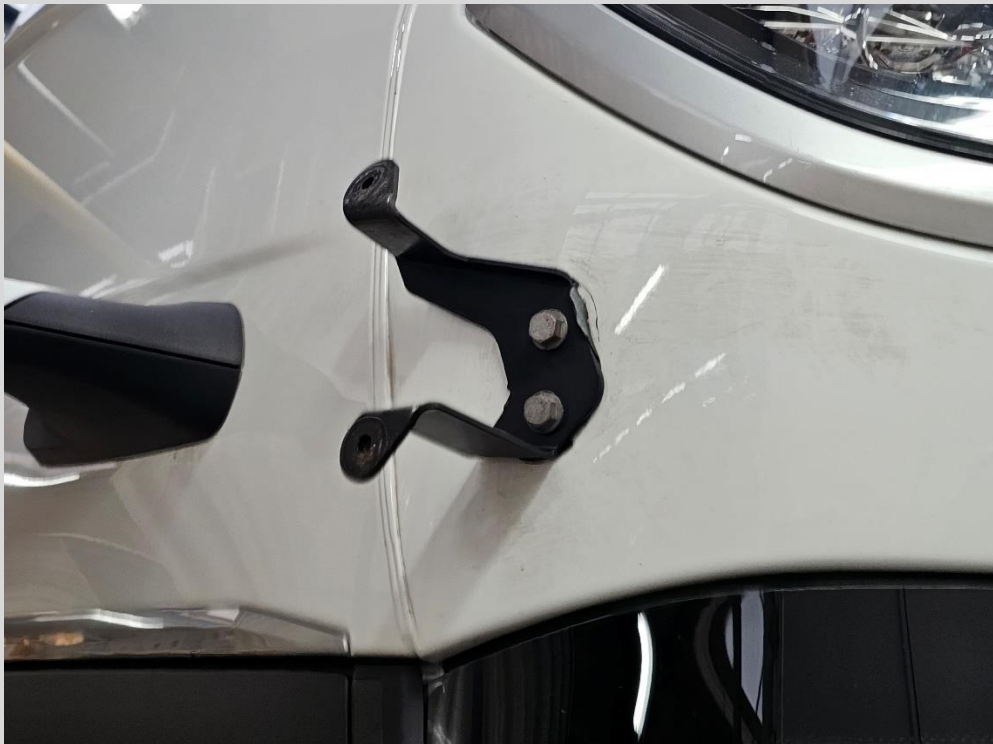
2 OUTER BRACKETS