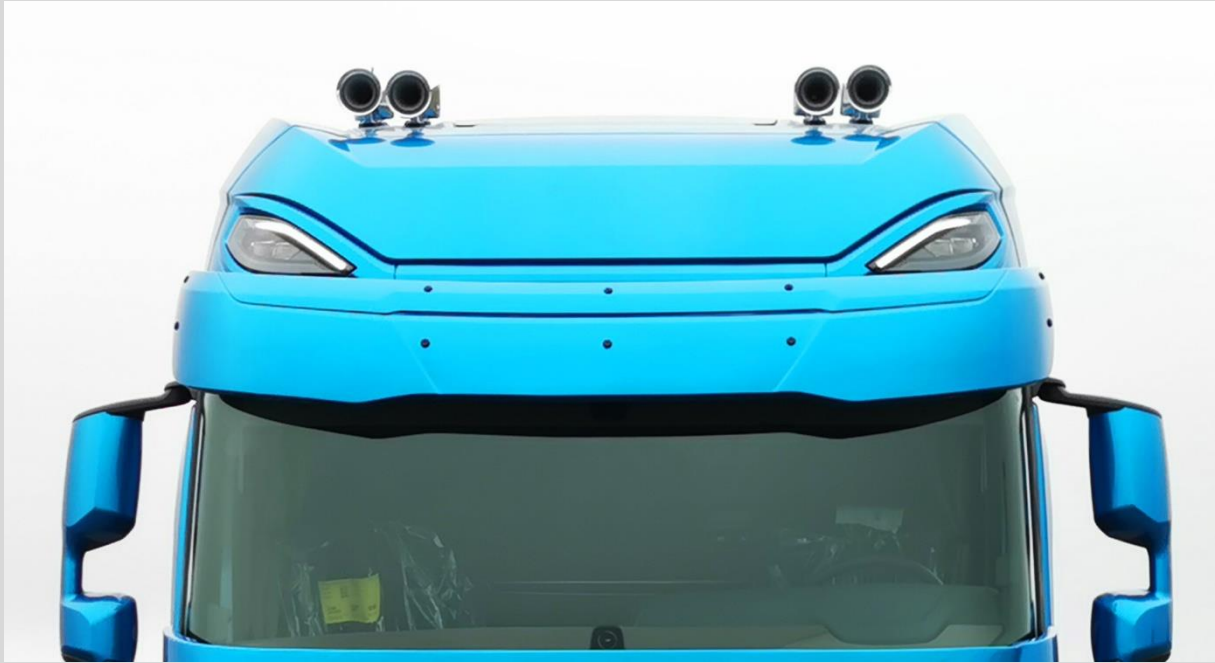
Sunvisor DAF XF/XG/XG+