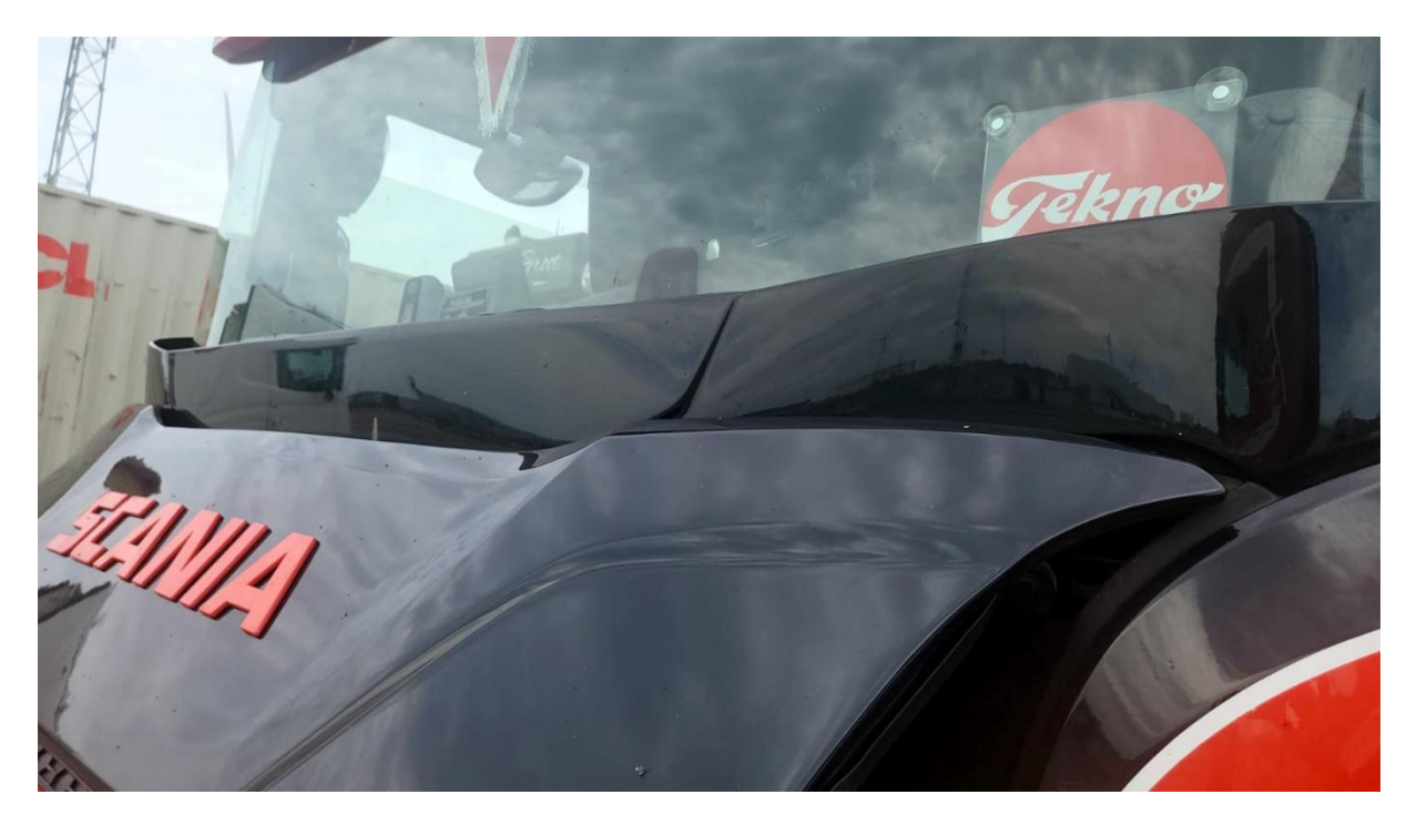
MAXIMUM OPENING POSITION GRILLE