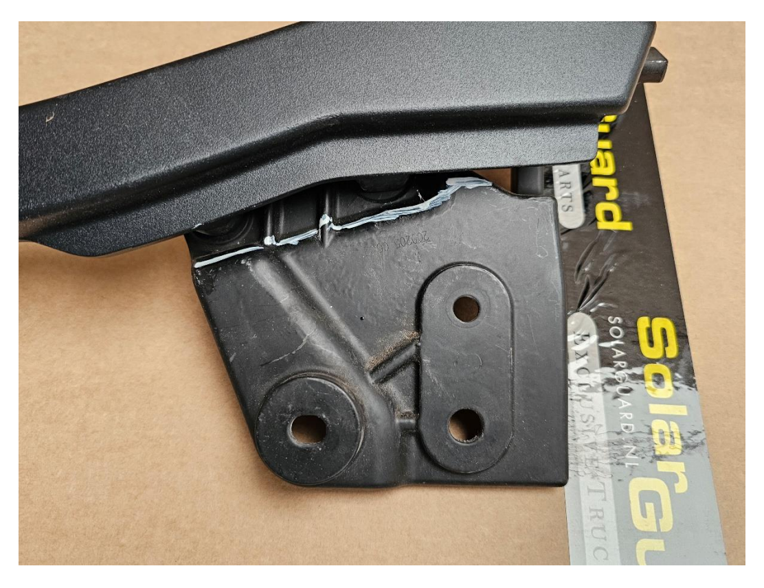
MARK THE BONNET HINGE AS SHOWN