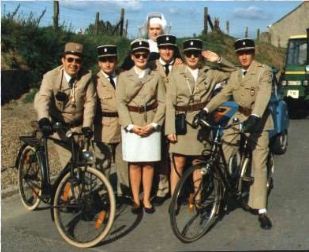
H Hemd inbegrepen