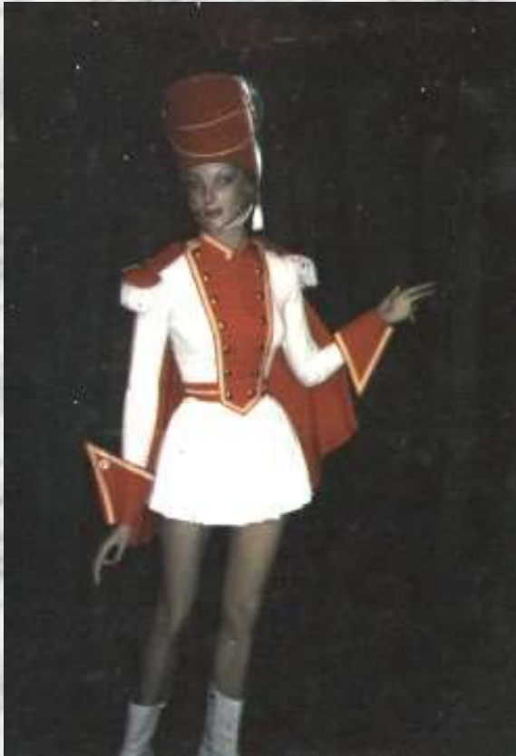
F met botten G