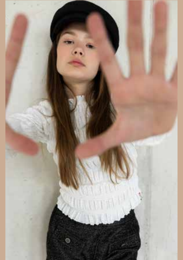
Black and White