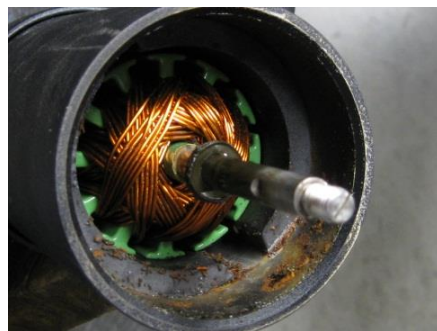
Figure 3 (Water damage to the lower unit)