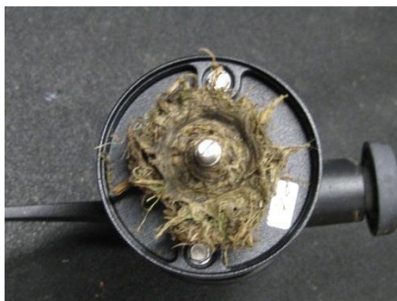
Figure 4 (Weeds caught behind propeller)

NOTE: We recommend removing the prop after every use to check for weeds or fishing line that may be caught behind it (Figure 4). This can result in damage to the seals and allow water into the motor (Figure 3). Debris is not always visible (Figure 2) which is why the prop must be remove to be properly inspected.