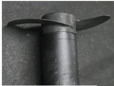
Figure 2 (Lower unit and prop with debris)

CAUTION: DISCONNECT THE MOTOR FROM THE BATTERY BEFORE BEGINNING ANY PROP WORK OR MAINTENANCE.