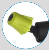
360° adjustable nozzle (Selecta 2 BO)