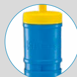
Ergonomic drive with simple handling