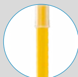
Adjustable outlet tube