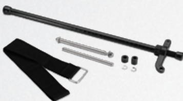
MKA-29 MAXXUM » RIPTIDE MAXXUM Attaches to side of motor.