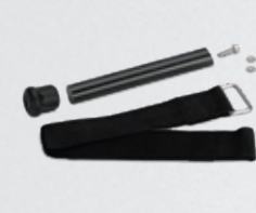
MKA-4 MAXXUM » RIPTIDE MAXXUM Attaches to upper arm of motor.

Heavy chop and wake can bounce your motor up and down – so stabilize it and protect it with one of these kits. It pivots into a vertical position when the motor is towed, locking it into place.