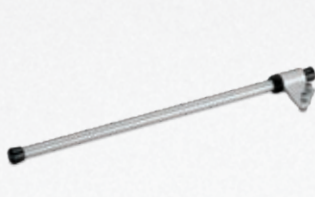
MKA-50 FORTREX » RIPTIDE FORTREX