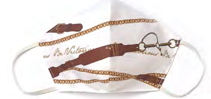
facemask be victorious | LT 20-03-M-013 | 100% chemical free cotton | € 29,95