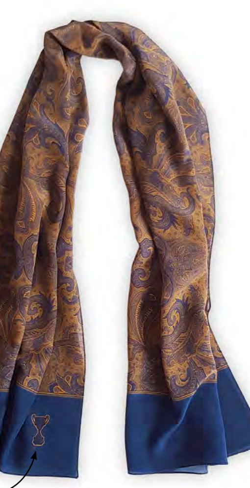
chain silver | scarf jewel LT 20-04-OS-026 | one size | 100% zinc € 29,95