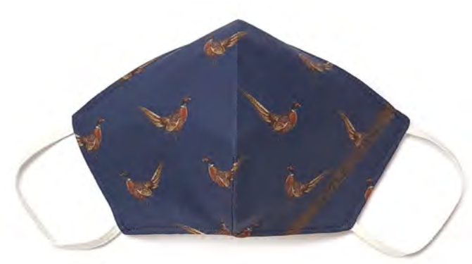
facemask pheasant | LT 20-03-M-01 | 100% chemical free cotton | € 29,95