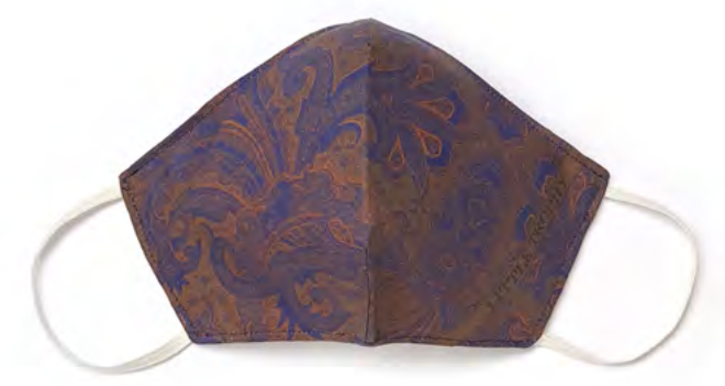
facemask paisley blue | LT 20-03-M-02 | 100% chemical free cotton | € 29,95