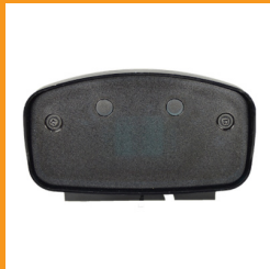
Radar 1167 RC