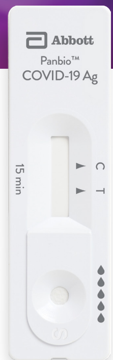
Panbio™ COVID-19 Ag Rapid Test Device