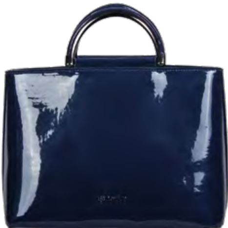
Aster handbag - 31079