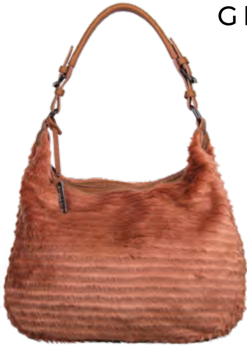
Ginger hobo - 30957