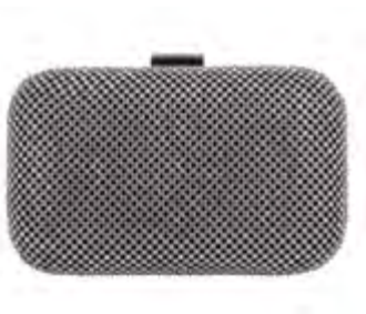
Jasmin box - 32600