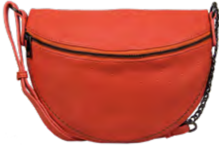
Deb crossover - 30996