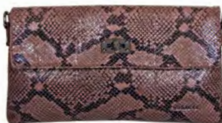
Quince clutch - 32643