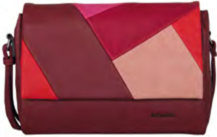
Milou crossover - 31135