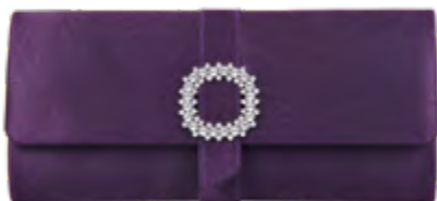
Stephi envelop - 32637