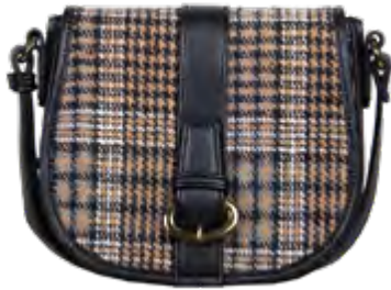
Kate saddlebag - 31105