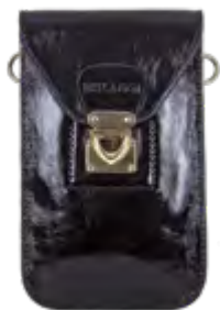
Acacia mobile pocket - 10471