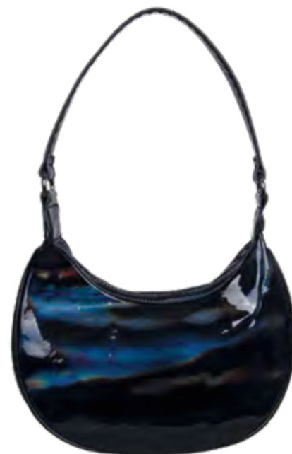
Rainbow hobo - 31129

● 10 Black 27x14,5x4 cm - 26 & 65 cm Extra shoulderstrap Interior: 1 slit pocket eco friendly