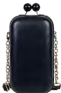
Wally minibag - 10474

99 Multi 30x12x2 cm Extra shoulderstrap 1 slit pocket