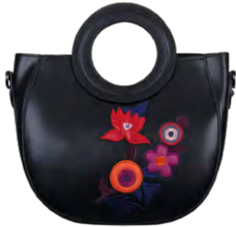
Bouquet handbag - 31093