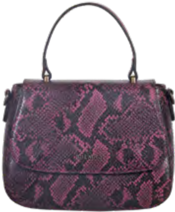
Quince saddlebag - 30941

● 69 Red 23x19x8 cm - 12 cm Extra shoulderstrap Exterior: back pocket Interior: 1 zip & 1 slit pocket