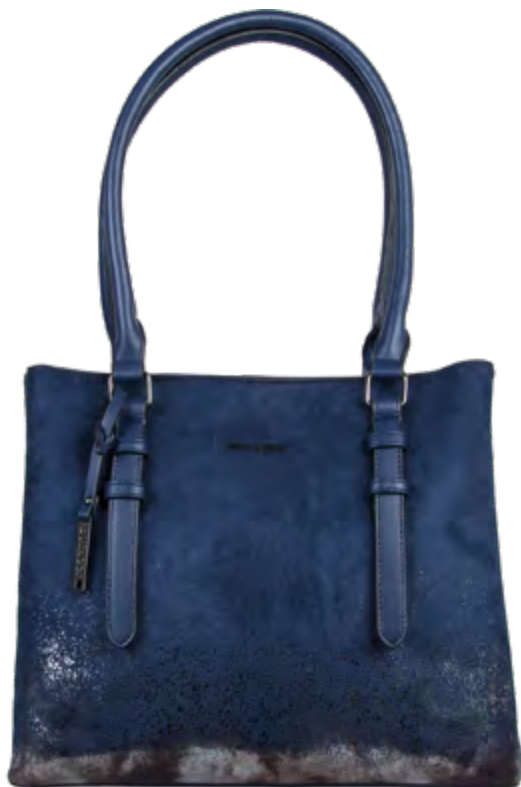
Flame shopper - 31109