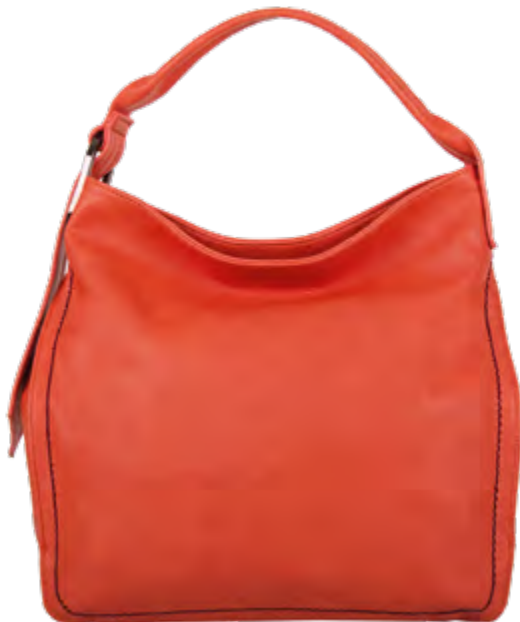
Deb hobo - 30998