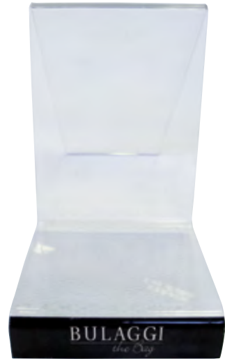
Clutch / wallet display - 0011