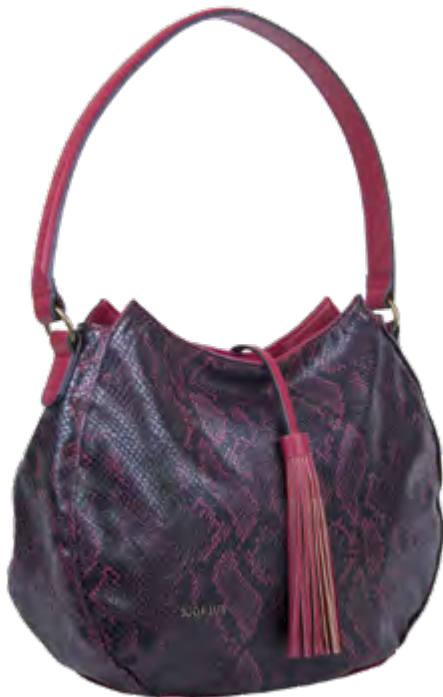
Quince hobo - 30942

● 69 Red 20x12x4 cm - 26 cm Extra shoulderstrap