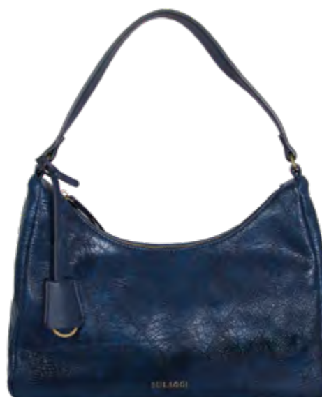
Meghan hobo - 31121