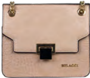
Liatri crossover - 31086