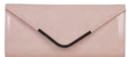
Sabella envelope - 32489