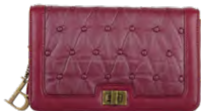
Chester crossover - 30984