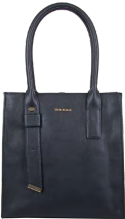
Basalt shopper - 31036