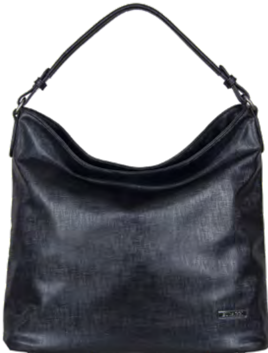
Gauze hobo - 31011