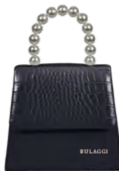
Eden partybag - 32648