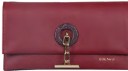
Quince clutch - 32632

● 69 Red 23x19x8 cm - 12 cm Extra shoulderstrap Exterior: back pocket Interior: 1 zip & 1 slit pocket