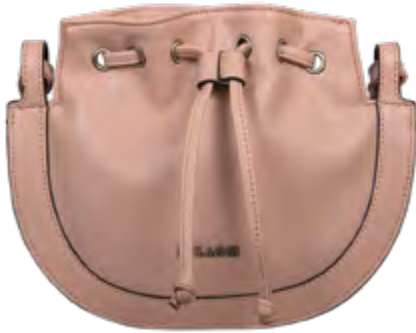
Larissa crossover - 31080