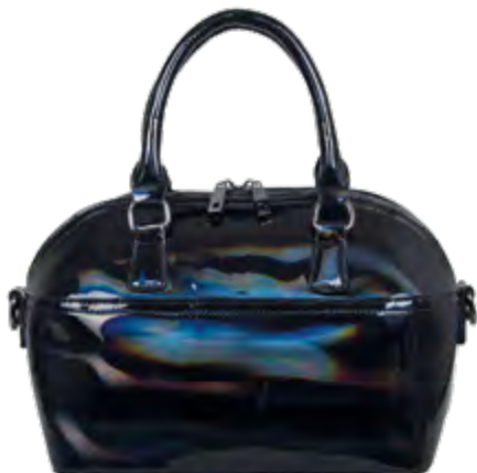
Rainbow handbag - 31134

● 10 Black 26x20x14 cm - 12 cm Extra shoulderstrap Closes with topzip Interior: side compartment, 1 zip+ 2 slit pockets eco friendly