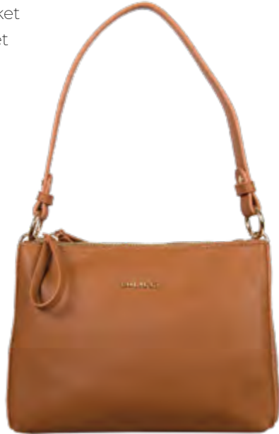
Basalt crossover - 31034