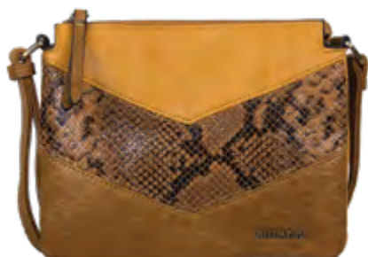
Alice crossover - 31115