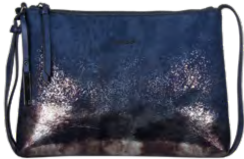
Flame crossover - 31107