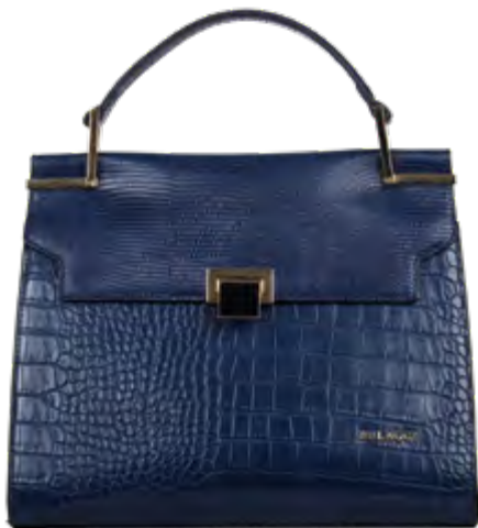
Liatri handbag - 31087

10 Black | 33 Camel | 43 Dark blue 23x14x8 cm Extra shoulderstrap Interior: 1 zip pocket