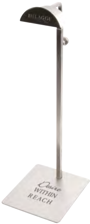
Metal bagstand - 0100