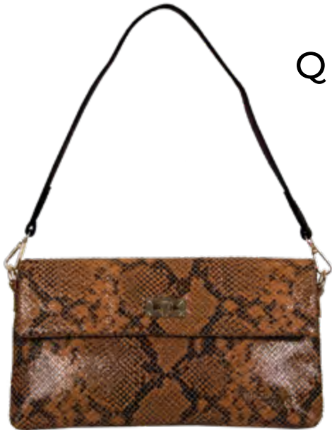
Quince clutch - 32643