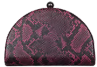
Quince box bag - 32635

● 69 Red 28x15x2 cm - 65 cm Extra shoulderstrap Closes with topzip Interior: 1 zip & 2 slit pockets