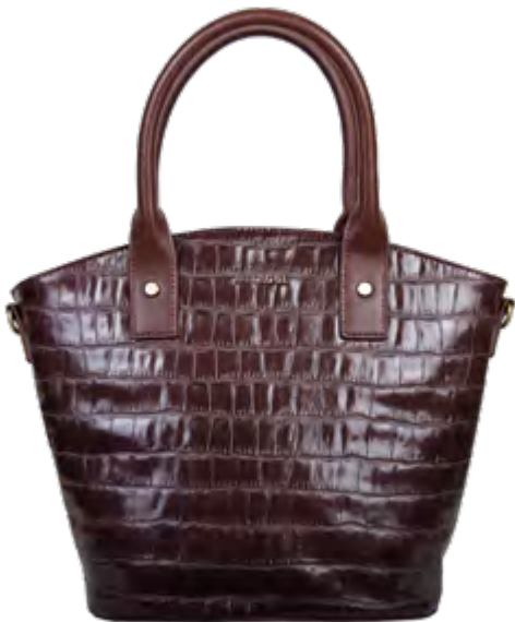
Iris bucket - 31075