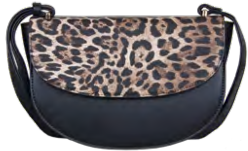
Leo saddlebag - 31104

Interior: mid compartment, 1 zip & 1 slit pocket