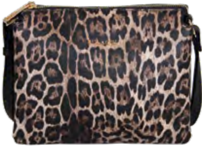
Leo crossover - 31103