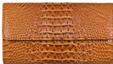
Lotus clutch - 32647