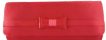
Pam clutch - 32547