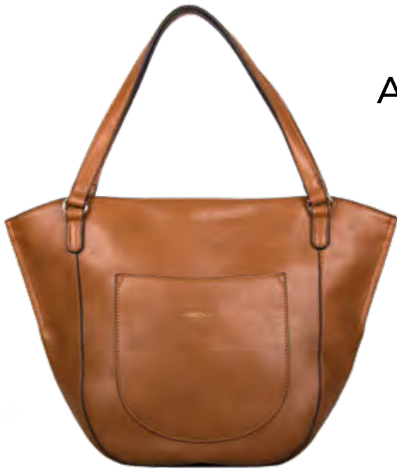
Acorn shopper - 31021