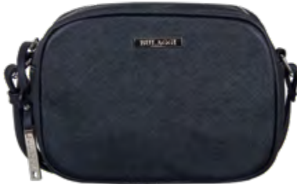
Gauze crossover - 31010