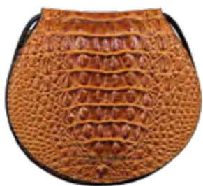
Lotus saddlebag - 31098