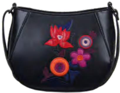
Bouquet crossover - 31092