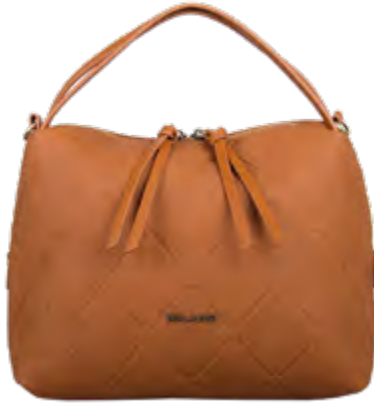
Sam handbag - 31126