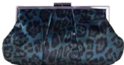
Paw framebag - 32638