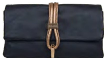
Bibis clutch - 32634