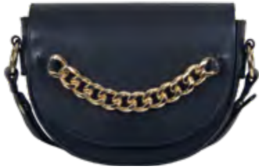
Chainy half moon bag - 31132