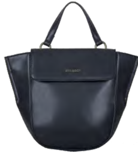
Acorn crossover - 31020

10 Black | 25 Cognac 21/42x31x10 cm - 23 cm Closes with topzip Exterior: back pocket Interior: 1 zip & 1 slit pocket eco friendly