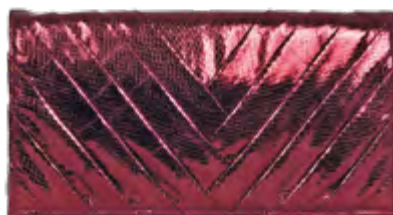
Waterfall clutch - 32646