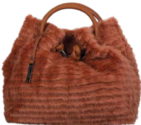
Ginger handbag - 30959