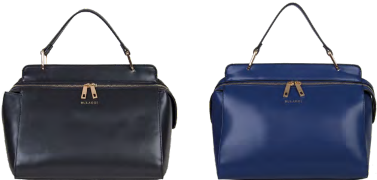
Kayla handbag - 30782