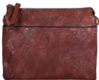
Meghan crossover - 31120