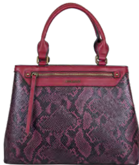
Quince handbag - 30943

● 69 Red 36x28x10 cm - 32 cm Closes with topzip Exterior: back pocket Interior: 1 zip & 1 slit pocket