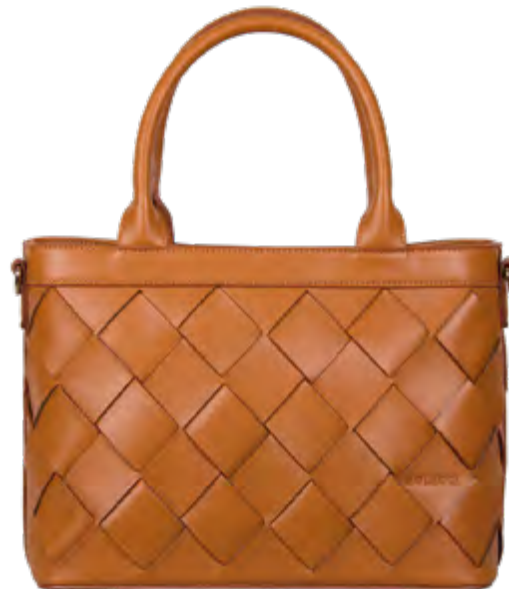
Block shopper - 31065