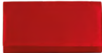
Bulaggi clutch - 32313