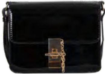
Aster crossover - 31077