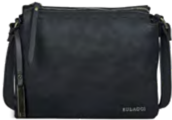
Gerbera crossover - 30991