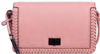
Anemoon crossover - 31084