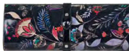
Maggy clutch - 32645

10 Black | 64 fuchsia 29x16x1 cm Extra shoulderstrap Exterior: back pocket