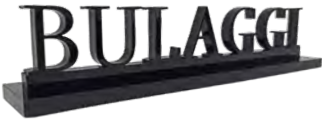
Logo block - 0090 22 cm