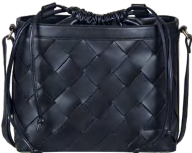
Block bucket - 31066