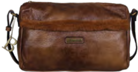
Lammy crossover - 31110