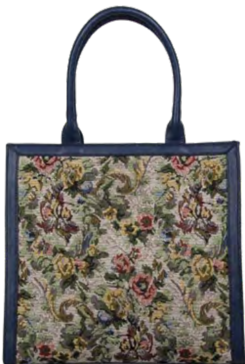
Goby shopper - 31102