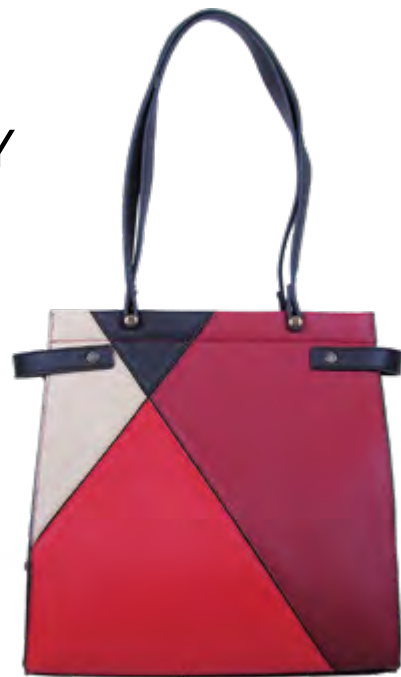
Peony shopper - 30963