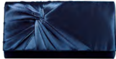
Twiggy envelope - 32608