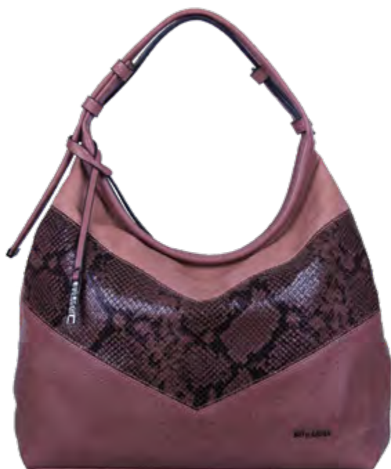
Alice hobo - 31117