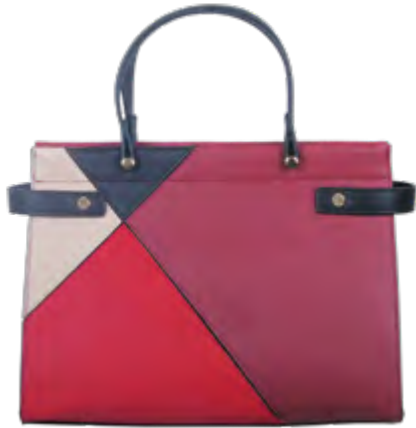
Peony handbag - 30962