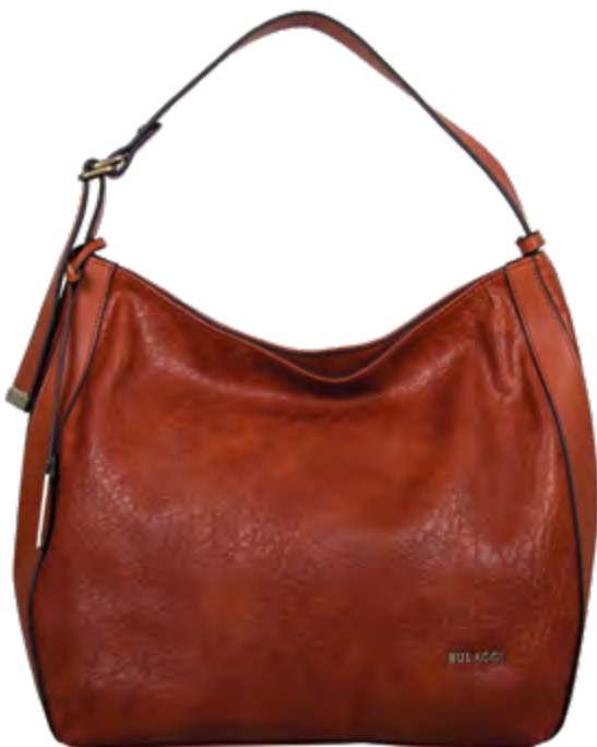
Heather hobo - 30990