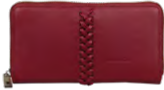
Anemoon wallet - 10473