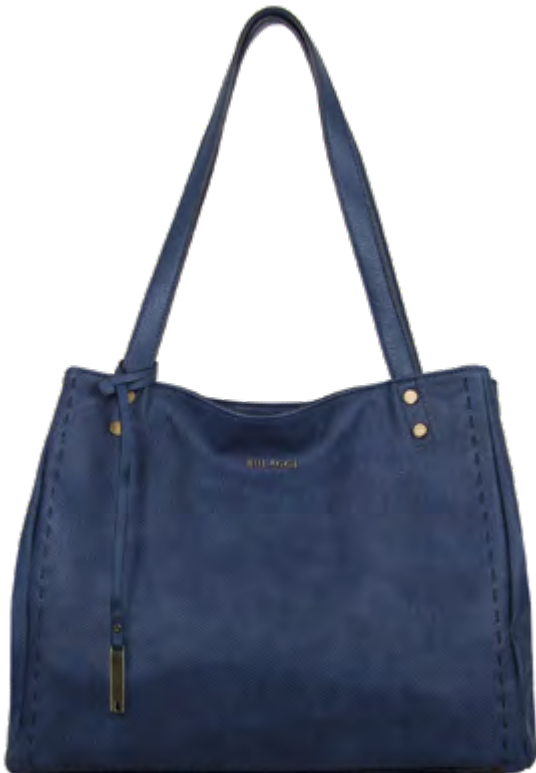
Gerbera shopper - 30993