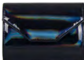
Rainbow clutch - 32649

● 10 Black 26x20x14 cm - 12 cm Extra shoulderstrap Closes with topzip Interior: side compartment, 1 zip+ 2 slit pockets eco friendly