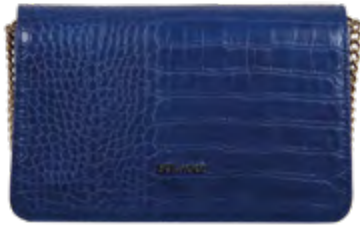
Eden crossover - 31123