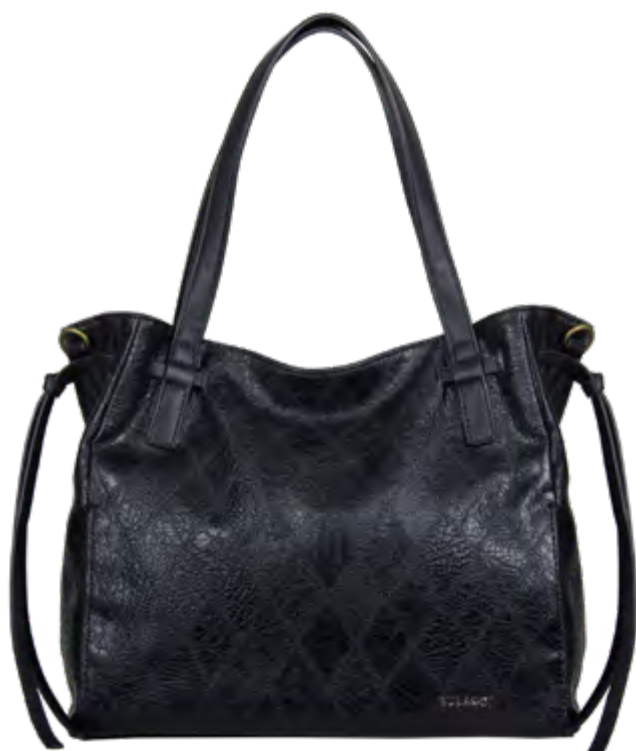
Meghan shopper - 31122