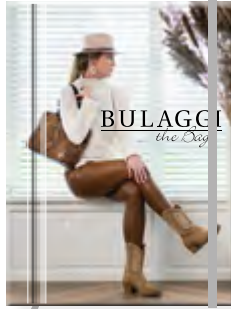
Noteblock - 0008 10.5x14.5 cm