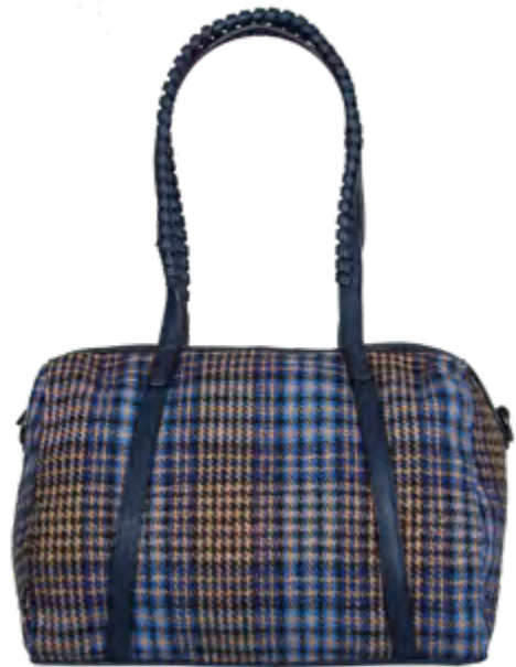
Kate bun - 31106