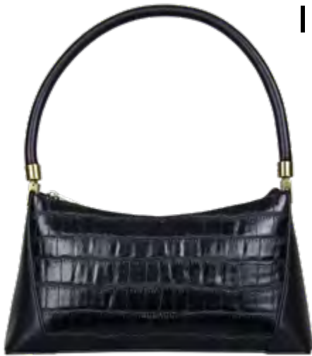
Iris baquette - 31073