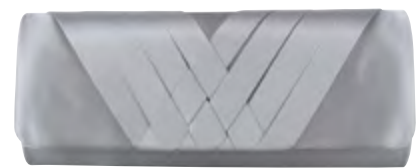
Suka clutch - 32508