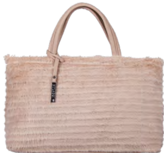
Ginger shopper - 30958