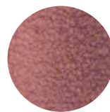
Teddy shopper - 31119