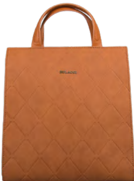
Sam shopper - 31128