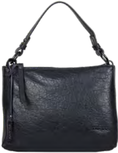
Heather crossover - 30989