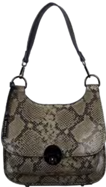
Quince crossover - 31113