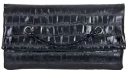
Croc clutch - 32631

10 Black | 45 Purple | 60 Burgundy 24x11x2 cm Short & long shoulderstrap Interior: 1 slit pocket