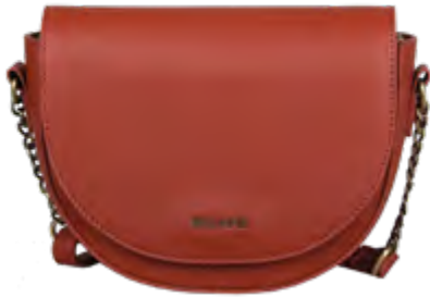
Cynthia half moon bag - 31095