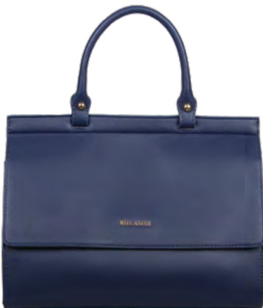
Cynthia handbag - 31097