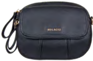
Basalt crossover - 31033