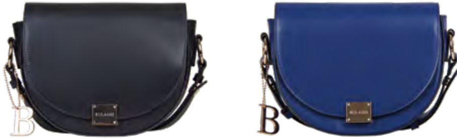
Kayla half moon bag - 30781