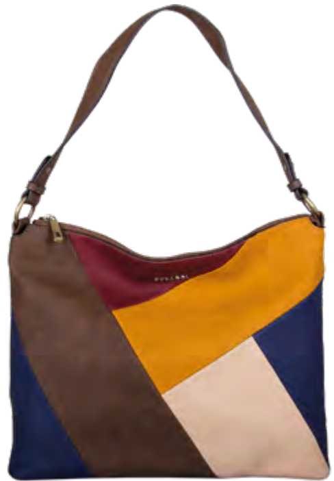
Milou hobo - 31136

Interior: mid compartment, zip & 2 slit pockets