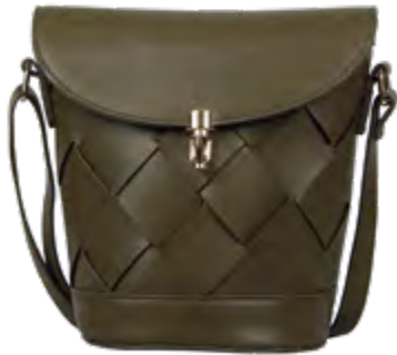
Block crossover - 31064