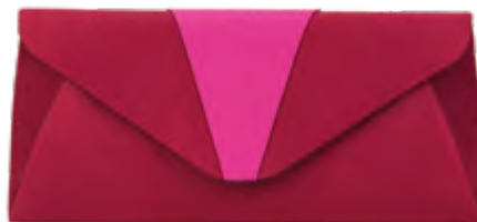
Aimy envelop - 32606

10 Black | 26 Taupe | 48 Dark purple 27x13x3 cm Short & long shoulderstrap Interior: 1 slit pocket