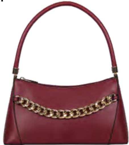
Chainy baquette - 31133

10 Black | 60 Burgundy 22x19x6 cm - 65 cm Adjustable shoulderstrap Exterior: back pocket Interior: 1 zip & 1 slit pocket