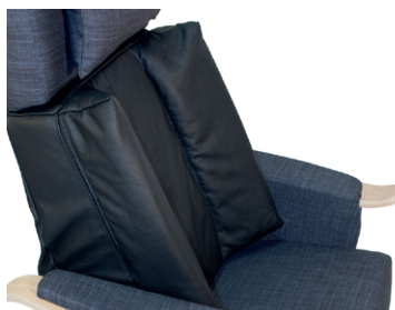
Cover for extra side support

A soft and comfortable cover for those who want increased comfort.