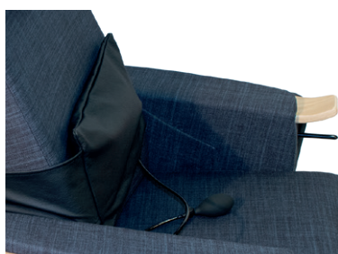
Inflatable lumbar support , Small Leather