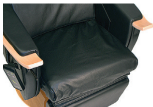
Incontinence cover seat