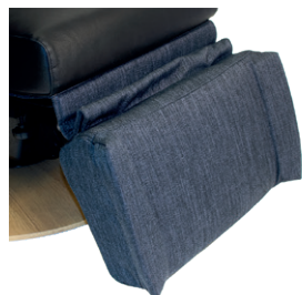
Footrest with side support Fabric