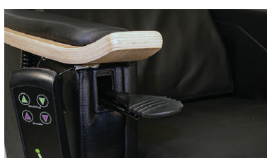
Easier swivel release