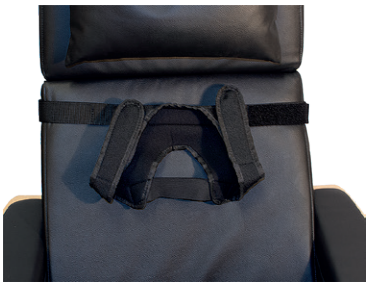
Belts Holding Small