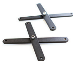
Scissor mechanism lift extension set

Table top for mounting on the right or left side of the chair. Mounted on the frame of the chair. Perfect for those who want to read, write or use a laptop in their chair.