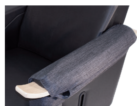
Armrest protector fabric

A detachable and washable cover over your original armrests for more protection. This simplifies cleaning and improves hygiene.