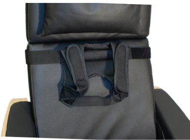
Belts Holding Medium