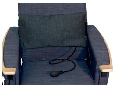
Inflatable lumbar support, Large Fabric

Inflatable air cushion with belt, supplied with special hand pump. The cushion can be fitted to whichever part of the backrest is most suitable for you. 25x50 cm