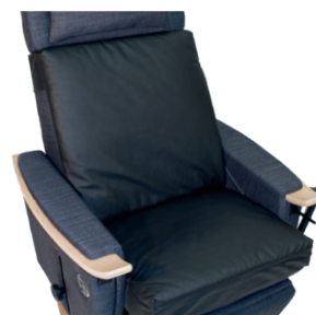
Supersoft cover +5 cm

A special cover which fits over the existing cover, with Dacron sewn into the entire cover. Makes sitting even softer and more comfortable. Thickness 3 cm.