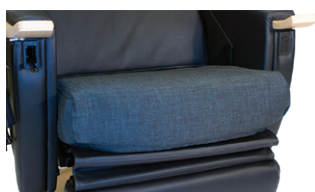
Incontinence cover seat

I Incontinence cover for seat with attached incontinence barrier on the inside. The cover can easily be removed and cleaned. Supplied with attached washing instructions.