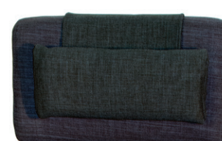
Small neck cushion

Small foam cushion that makes a firmer cushion. Hight: 15 cm, Width: 37 cm, Depth: 4 cm.