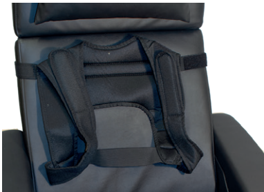
Belts Holding Extra-large