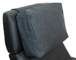
Extra-large neck cushion

Hight: 25 cm, Width: 40 cm, Depth: 12 cm.