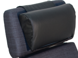
Large neck cushion

H: 18 cm, W: 36 cm, D: 6,5 cm (teardrop).