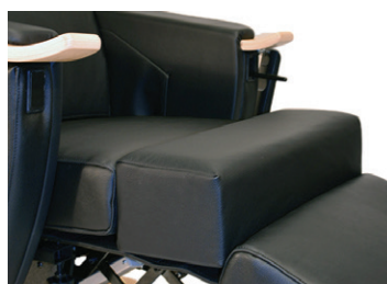
Cushion insert between seat Leather