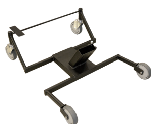
Castor chassis With central braking