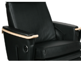
Deep seat cushion Leather

Consists of foam and gel pockets. A softer cushion before increasing pressure relief to avoid sitting sores. Depth 52 cm, Thickness 11 cm.