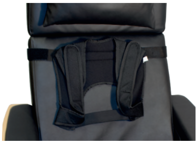
Belts Holding Large