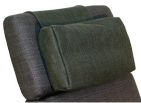
Adriana neck cushion

Hight: 19 cm, Width: 35 cm, Depth: 9 cm.