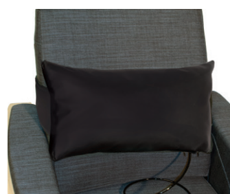
Inflatable lumbar support, Large Leather

Inflatable air cushion with belt, supplied with special hand pump. The pillow can be attached anywhere on the back of the chair as needed. 20x40 cm.