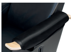
Armrest protector fabric

A feature that is pulled over your original footpad cover for increased protection. This simplifies cleaning and improves hygiene.