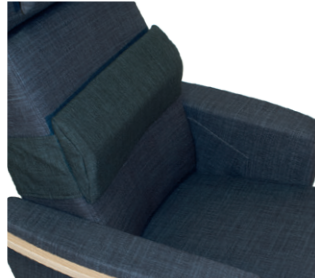
Small backrest cushion

With belt. Foam cushion with triangular profile. The cover is designed to allow the cushion to be fitted around the chair's backrest. This means that it can be fitted to whichever part of the backrest is most suitable for you. Height: 19 cm.