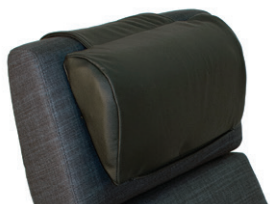
Medium neck cushion

Small foam cushion that makes a firmer cushion. Hight: 15 cm, Width: 37 cm, Depth: 4 cm.