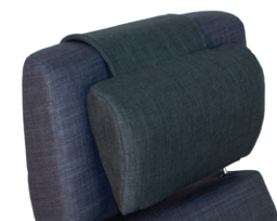
Medium neck cushion

H: 18 cm, W: 36 cm, D: 6,5 cm (teardrop).