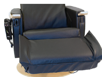
Footrest with side support Leather

Increases the height of the standard foot pad by 3 cm.