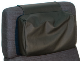
Adriana neck cushion