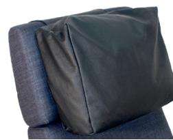
Extra-large neck cushion

Hight: 19 cm, Width: 35 cm, Depth: 9 cm.