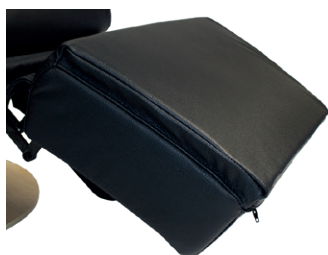
Height-extending footrest cover Leather