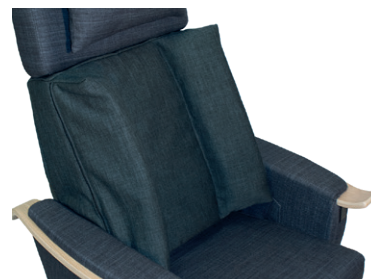
Cover for extra side support

For extra side support. Special cover which fits over the lower backrest. The cover contains two vertical foam wedges. A 2cm Dacron strip is sewn in between the two wedges. Perfect for people with stability problems. The wedges start their construction 10cm from each side of the back and build 10cm in depth.