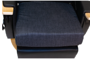
Seat cushion with pressure relief Fabric

With 3 cm pressure relieving foam. Depth: 52 cm, Thickness: 11 cm.