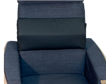
Large backrest cushion

With belt. Foam cushion with triangular profile. The cover is designed to allow the cushion to be fitted around the chair's backrest. This means that it can be fitted to whichever part of the backrest is most suitable for you. Height: 19 cm.