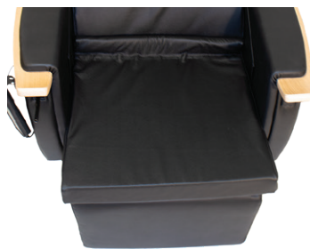
Plate seat can be used both ways so that the edge is front or back. Depth: 45 cm.