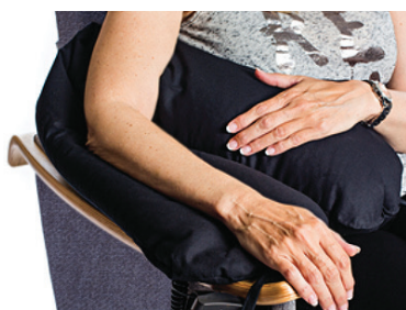
Support cushion Toril Fabric (svart)

Inflatable air cushion available with belt, supplied with special hand pump. The cushion can be fitted to whichever part of the backrest is most suitable for you. 25x50 cm.