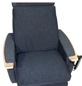
Supersoft cover + 5 cm

A soft and comfortable cover for those who want increased comfort.