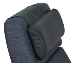
Small neck cushion

Extra-large, single-chamber neck cushion filled with beanbag pellets. Supplied with fabric cover. Extremely soft, good-quality neck cushion which provides excellent support. You can adjust the firmness and support by adding or removing beanbag pellets. Beanbag pellets give off heat for tight muscles. H: 25 cm, W: 40 cm, D: 12 cm.