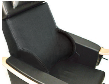
Backrest with trunk support

With belt. Foam cushion with triangular profile. The cover is designed to allow the cushion to be fitted around the chair's backrest. This means that it can be fitted to whichever part of the backrest is most suitable for you. Height: 24 cm.