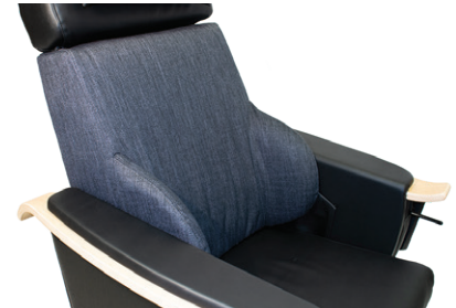
Backrest with trunk support

The trunk support is 30 cm high and 15 cm deep on each side of the back.