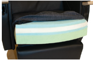
Seat cushion with pressure relief Leather