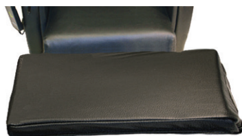
Extra-wide footrest Leather