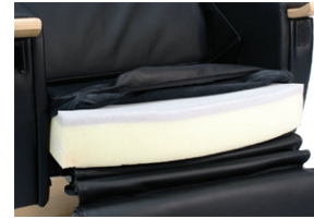
Gel seat cushion Leather

With 3 cm pressure relieving foam. Depth: 52 cm, Thickness: 11 cm.