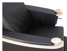
Ball in front of wooden armrests

Fits all models in 40/45/50/55 cm width.