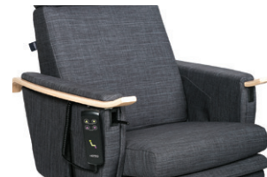
Deep seat cushion Fabric

A deeper seat cushion for you who seems standard pillow is too short. Depth 55 cm, Thickness 11 cm.