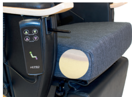
Gel seat cushion Fabric

Consists of foam and gel pockets. A softer cushion before increasing pressure relief to avoid sitting sores. Depth 52 cm, Thickness 11 cm.