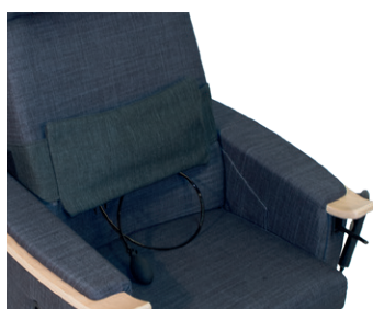
Inflatable lumbar support, Small Fabric

Inflatable air cushion with belt, supplied with special hand pump. The pillow can be attached anywhere on the back of the chair as needed. 20x40 cm.