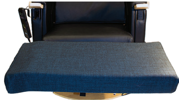
Extra-wide footrest Fabric