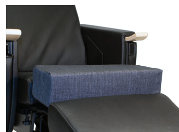
Cushion insert between seat Fabric