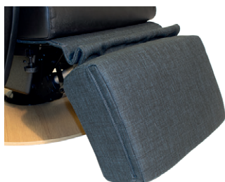
Height-extending footrest cover Fabric

Increases the height of the standard foot pad by 3 cm.