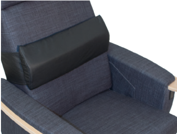
Small backrest cushion