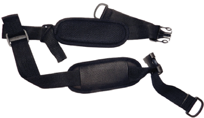
Hip belt Large