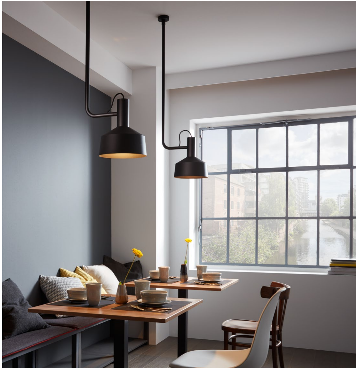
CAFÉ AMSTERDAM | NETHERLANDS