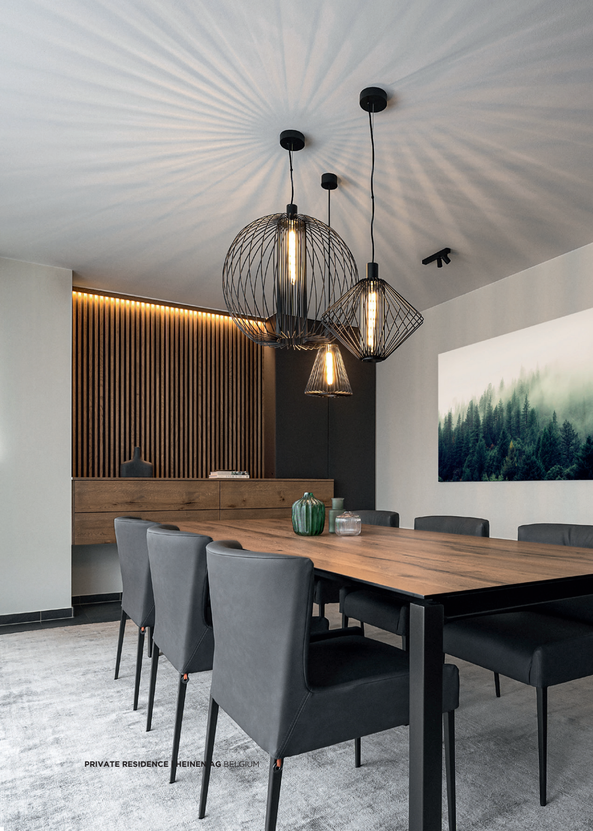
PRIVATE RESIDENCE HEINEN AG BELGIUM