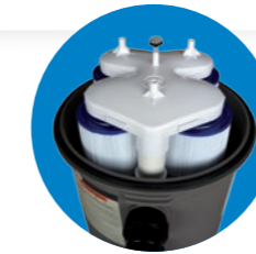
Top manifold for better filtration and optimised hydraulic performance

High-capacity SwimClear™ cartridge filters offer a very high retention capacity with minimum maintenance. Their reinforced polyester cartridge extends cartridge filter durability and a limited maintenance.