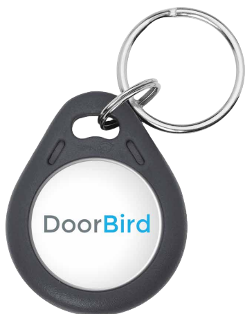
Key Fob front