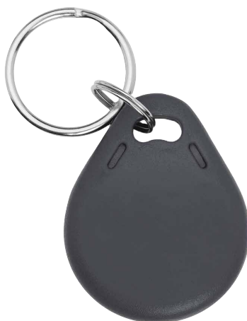
Key Fob back