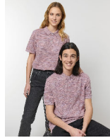
Prepster Space Dye