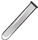
the Flower Tube