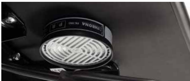
Detail of HEPA high filtration efficiency filter

Specialty chairs and stools provided with standard accessories for use in Clean-Room environment up to class ISO 4. Particular care has been given to the technical details in order to guarantee an optimal functionality on special applications: sealed edges all around the seat, Hepa filter under the seat, sealed piston.