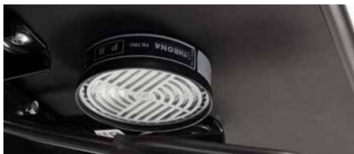
Detail of HEPA high filtration efficiency filter