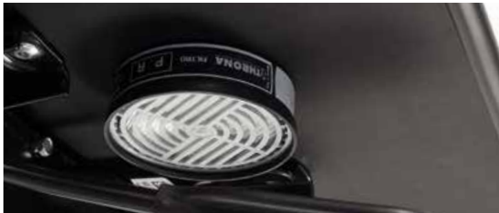
Detail of HEPA high filtration efficiency filter

Specialty chairs and stools provided with standard accessories for use in ESD Clean-Room environment up to class ISO 4. Particular care has been given to the technical details in order to guarantee an optimal functionality on special applications: sealed edges all around the seat, Hepa filter under the seat, sealed piston.