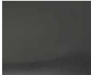
Nero - Black BLK-ESD