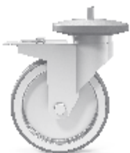
Set of stainless steel wheels \varnothing 125mm with plastic protecting bumpers (4 pcs), 2 pcs with brakes. €103