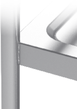
Heavy duty welded shelves