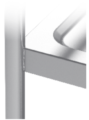
Heavy duty welded shelves